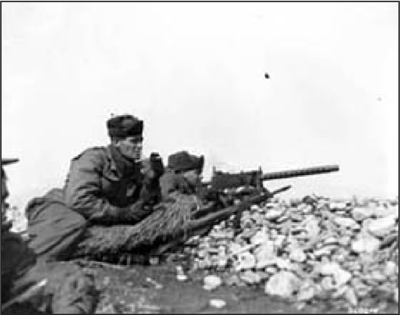
Company K, 35 th RTC, 25 th Division

In 1950, an ill-prepared United States found it needed to commit large numbers of troops to a nation a half a world away. The North Korean attack on South Korea, America’s ally, stressed American responsibilities overseas in the post-World War II era. It became clear from this point forward that American commitments in Asia, Europe, and the Pacific required a strong and combat-ready professional Army.