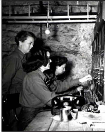
Enlisted women of the Signal Corps

In 1945, Congress passed legislation entitling enlisted men with at least 20, and not more than 29 years of service, to retire. They thereupon drew 2 ½ percent of their average pay for the six months preceding retirement, multiplied by the numbers of years of active service. These men remained in the reserve until completion of 30 years of service. (*Fisher)