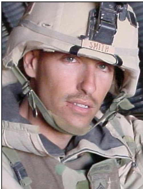
SFC Paul Ray Smith

After fighting for three consecutive days, Smith and his men pushed forward to Baghdad on the night of 3 April. They reached an area to be used as a blocking position between the airport and Baghdad at 0600 on 4 April. The road to the airport, Highway 8, consisted of a four-lane highway with a median. On each side of the highway were large masonry walls with towers about 100 meters apart. Early in the morning on 4 April, the Platoon Leader went on a reconnaissance mission with the B Company, Task Force 2-7 Commander, leaving Smith in charge of the troops. (*Medal of Honor) Firing could be heard to the south; however, around the 2 nd Platoon's area, all was quiet.