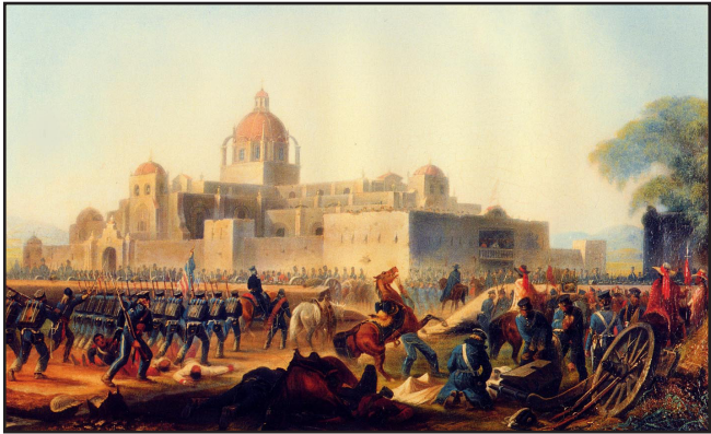
The Assault on Churubusco

In March 1847, the Americans made an amphibious landing at Veracruz, Mexico and headed for Mexico City. This bold move sought to crush Mexican resistance by taking their capital. The road to Mexico City proved indeed to be a bloody one.