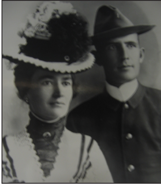
Sergeant Major and his wife