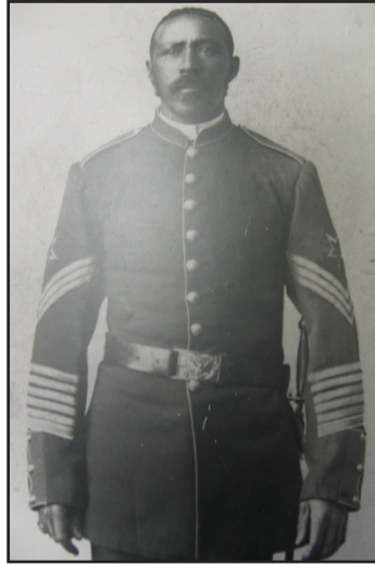
Ordnance Sergeant of the 25 th Infantry, 1885