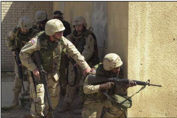
Searching the Streets in Iraq