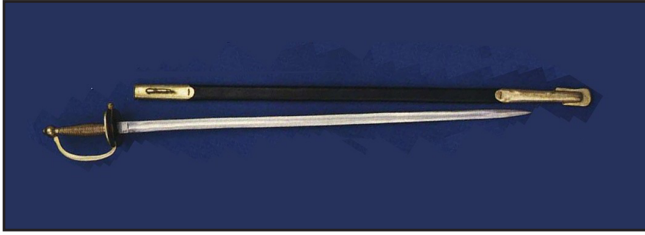
Model 1840 Noncommissioned Officer Sword