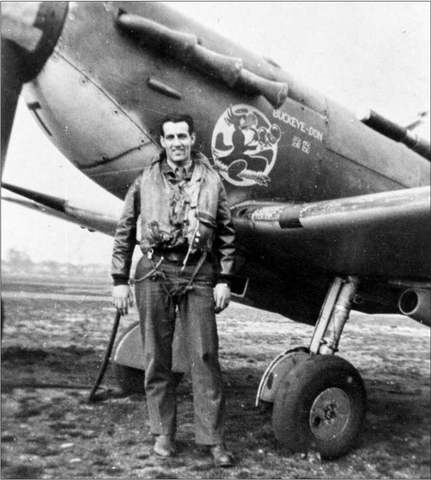
Dominic "Don" Gentile in front of his Spitfire Mark VB.

lets. The New York Times , Washington Post , and Time magazine published many stories, especially when squadron members received British decorations for gallantry in combat. Another venue occurred through the medium of motion pictures. In July 1942, the American-made movie, Eagle Squadron , received its premiere showing in London. Members of 71 Squadron were not involved in the actual production of the film but believed it would be a documentary style film. This belief was reinforced by the fact that movie crews had filmed scenes of the unit at North Weald. As the case turned out, the film which featured Robert Stack, Diana Barrymore, John Hall, Eddie Albert and Nigel Bruce, turned out after a brief introduction by the respected journalist Quentin Reynolds to be a typical Hollywood fictionalized war story. Most of the Eagles who attended the premier