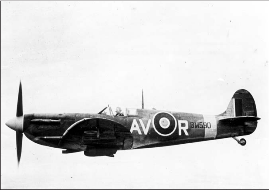
Supermarine Spitfire Mark VB.

tion; 121 Squadron moved to North Weald and 133 Squadron transferred to Kirton-in-Lindsey.