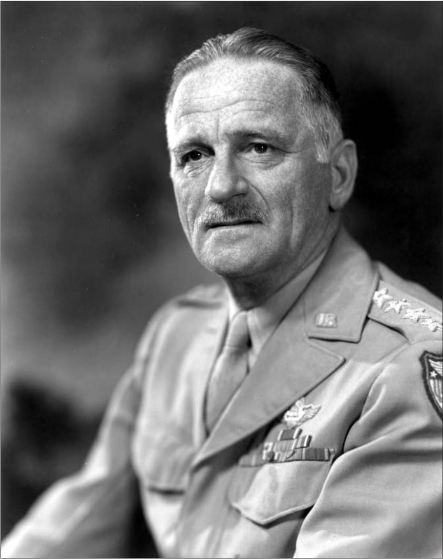
General Carl A. Spaatz.