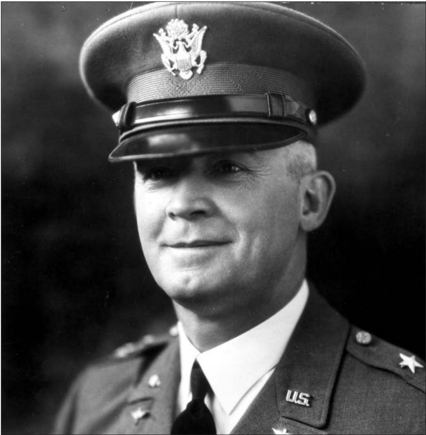
Maj. Gen. Henry H. "Hap" Arnold.

The American Eagle Squadron pilots did not have to wait long for their first taste of combat. After arriving at Martlesham Heath in April 1941, 71 Squadron pilots flew several missions including one off the French coast, south of Boulogne where they encountered German aircraft but did not record any aerial victories. On May 15, two Eagle Squadron pilots engaged in a dogfight with three Bf 109s over the English Channel and during this encounter, one Bf 109 was damaged near Calais. The Americans, however, did not escape unscathed: one Hurricane was damaged, due in part to being hit by fire from another American aircraft, and had to crash land.