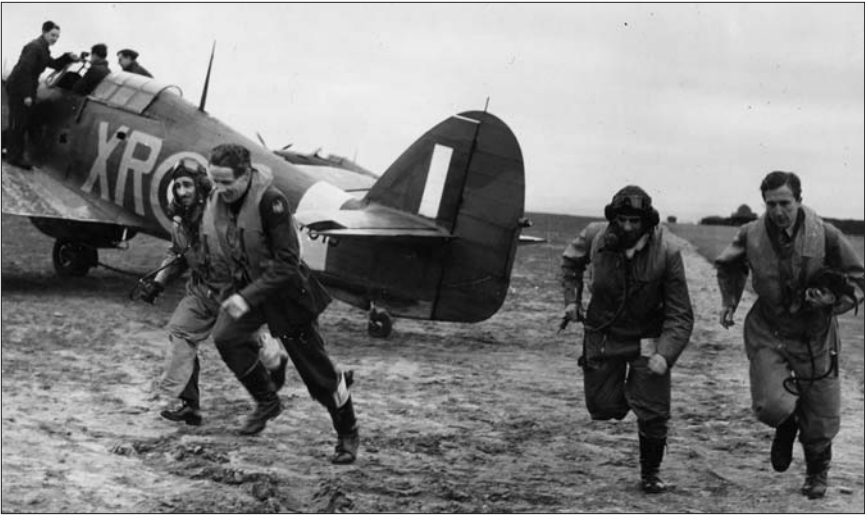
71 Squadron pilots scramble to their planes.

or two Hispano 20 mm cannons, or both at the same time.