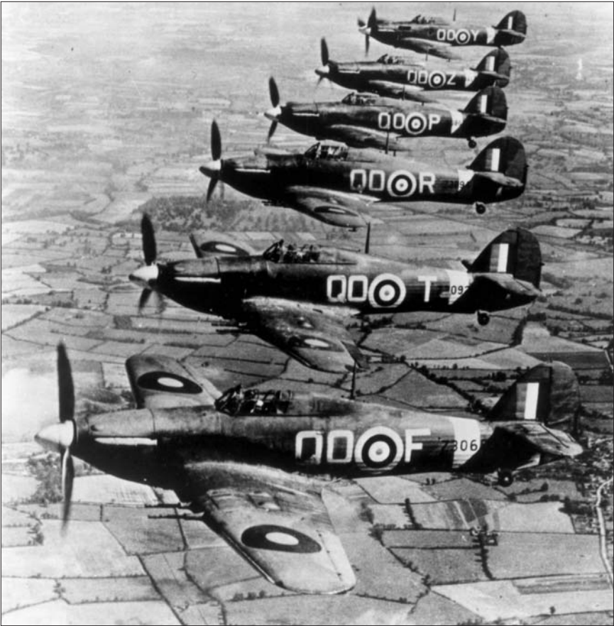
Hawker Hurricane II.