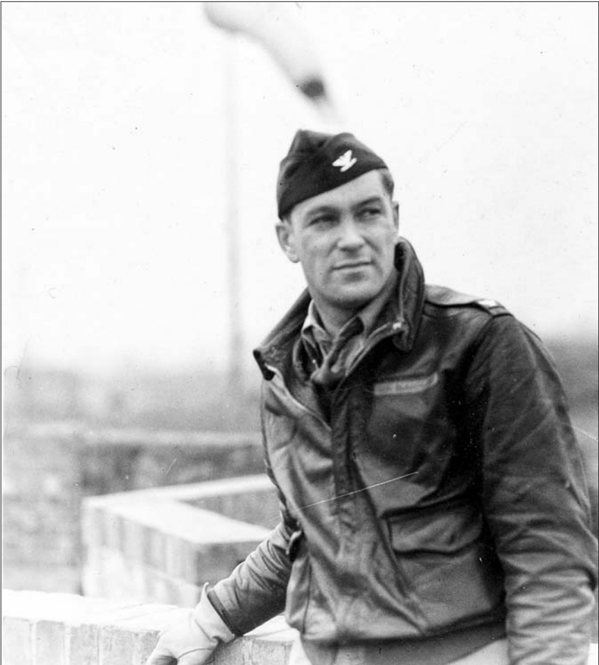
Col. Donald Blakeslee in US Army Air Forces.

American air units were becoming increasingly involved in the war in Europe at this time. On August 17, 1942, 12 B-17s of the 97th Bomb Group took part in the first heavy bomber attack from the United Kingdom when the aircraft attacked the Rouen-Sotteville, France, marshalling yards. The B-17s were escorted by RAF Spitfires included ones flown by 133 Squadron pilots. During the Dieppe Raid, the American 309th Fighter Squadron, 31st Fighter Group, provided air cover over the ground operations and 22 B-17s dropped 34 tons of bombs on the Abbeville/Drucat, France airfield in an attempt to draw German fighters away from the landing force.