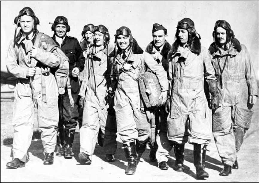
Eagle Squadron pilots completing training, October 1940.