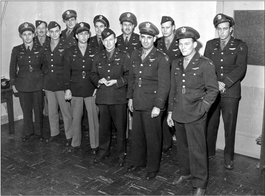
Group picture of former Eagle Squadron pilots in the USAAF.

as one of the youngest colonels in the USAAF and Blakeslee as commander of the Fourth Fighter Group.