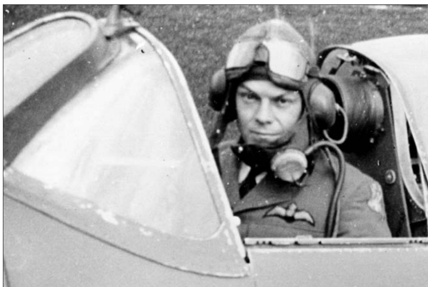
William Dunn in his Supermarine Spitfire Mark IIA at RAF Station North Weald, 1941.

Andy Mamedoff, one of the original Eagle Squadron pilots, was among the deceased.