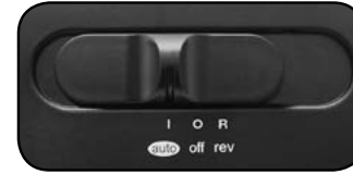
▲ Power switch in auto position

Use thick paper stock or greeting card to push the jam through ►