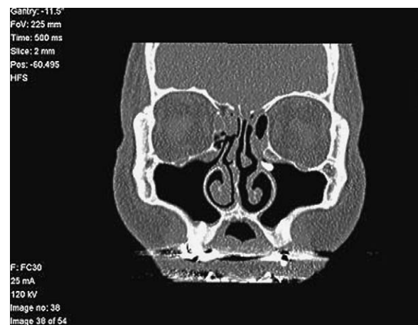
Fig. 1. Computed tomogram (coronal view) showing the root as an 8 mm radio opacity in the left superior medial aspect of the maxillary sinus.

We used the surgical expertise of our ear, nose, and throat colleagues in this procedure as the zero degree endoscope was inserted into the nose through the left nostril, and was manipulated past the inferior concha into the middle meatus where the maxillary sinus was entered through the opening