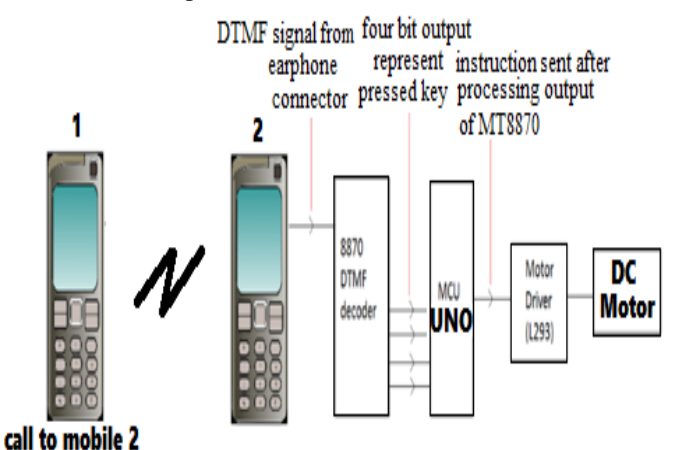
Fig: 4 Approach of our research

We connect a mobile phone as Fig: 4 on robotic car and call to that phone from other cell phone. Mobile no. 2 is in auto answering mode. Call is pickup automatically then after we press number from mobile 1 keypad that produces DTMF tone. DTMF tone is identified by MT8870 decoder IC connected through mobile ear pin. The data is processed in Arduino and Arduino send signal to motor driver IC to control the rotation of motors. Fig: 5 robotic car moves when we press 2, 4, 6 & 8 button on mobile after call on cell phone 2 from other cell phone. [5]