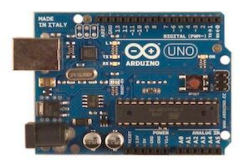
Fig: 3 Arduino UNO

Arduino as shown in Fig: 3 is an open-source physical computing platform based on a simple input or output board and a development environment that implements the Processing/Wiring language. [3]