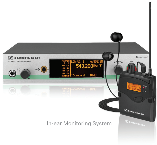
In-ear Monitoring System

UHF Channel 37 (608–614 MHz) has not been used for TV broadcast. Rather, it has been used for wireless medical telemetry (“WMTS”) (e.g., monitoring a patient’s vital statistics in a hospital). It has also been used in a few remote geographic areas for radio astronomy (“RAS”) studies. Wireless microphones have never been permitted to operate on Channel 37, and this is not changing.