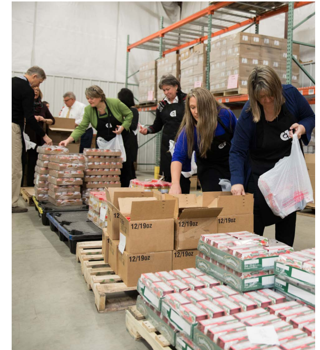
Channel One Regional Food Bank, Mayo's Season of Giving.