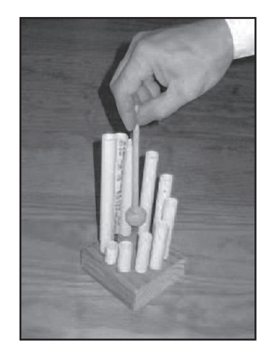
When Kovac "stirs" the mallet around this Rührtrommel , it makes a clip-clopping sound.