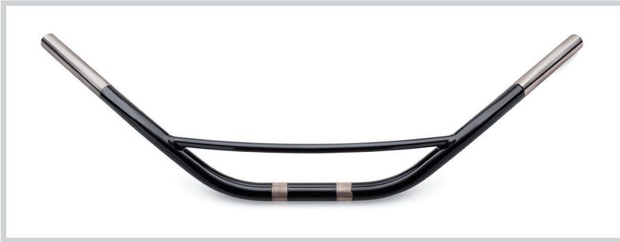
HOLLYWOOD HANDLEBAR – GLOSS BLACK