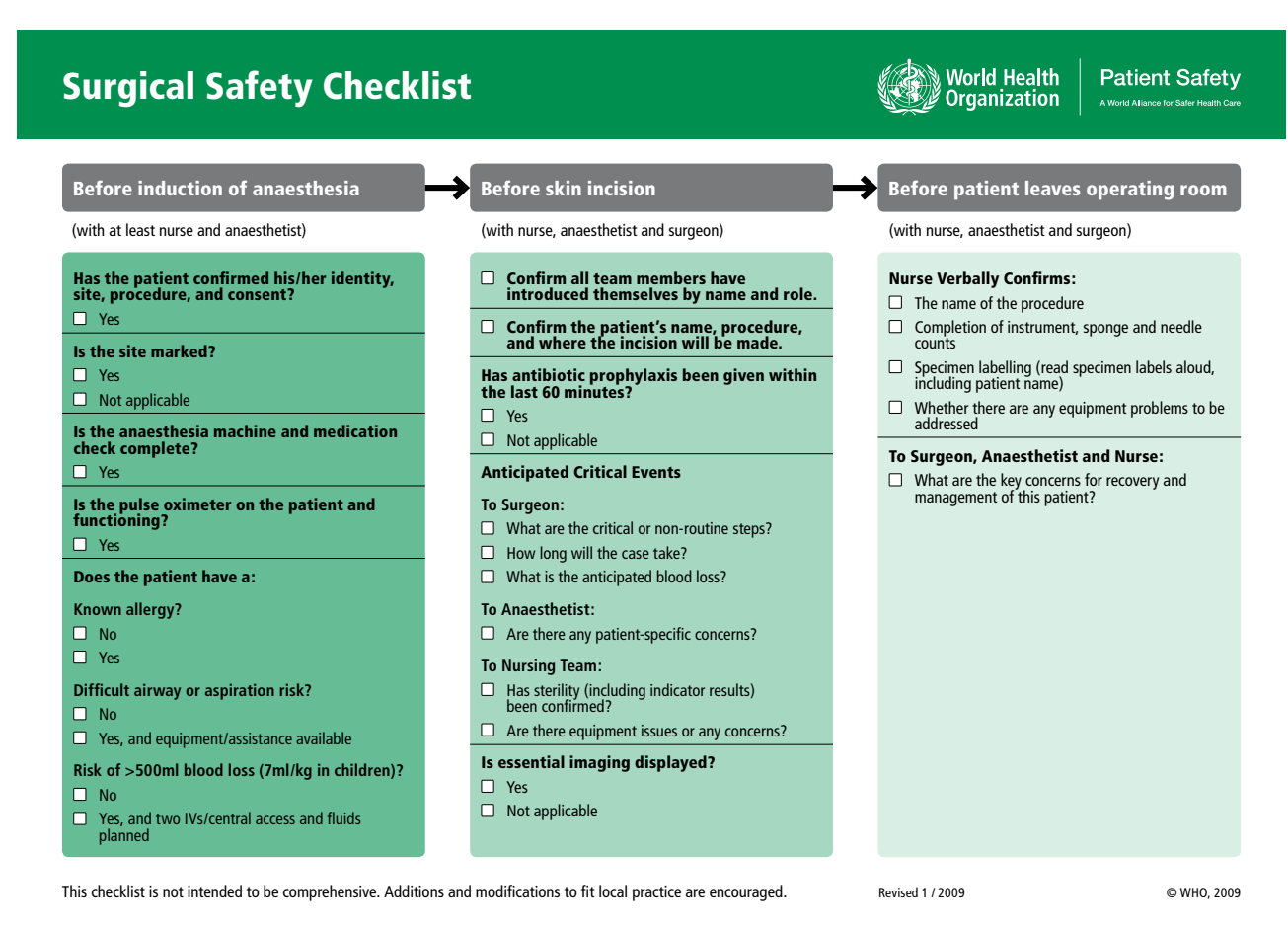
Figure 1. WHO Surgical Safety Checklist. Reproduced with permission of the World Health Organization