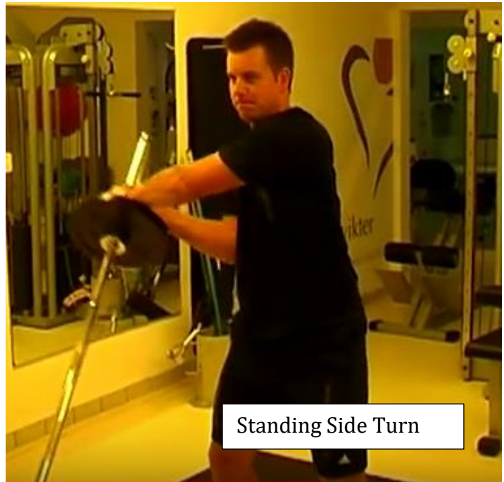
Standing Side Turn

posture is. Most golfers will have a rounded back when trying to do this exercise and then it becomes unsafe. It is definitely an exercise you work up to.