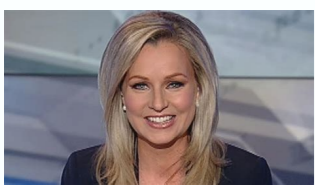
Black female reporters on fox news. Best reporters on fox news. Female reporters on fox news channel. British reporters on fox news. Investigative reporters on fox news. Past reporters on fox news. Weather reporters on fox news. Reporters on fox news channel.