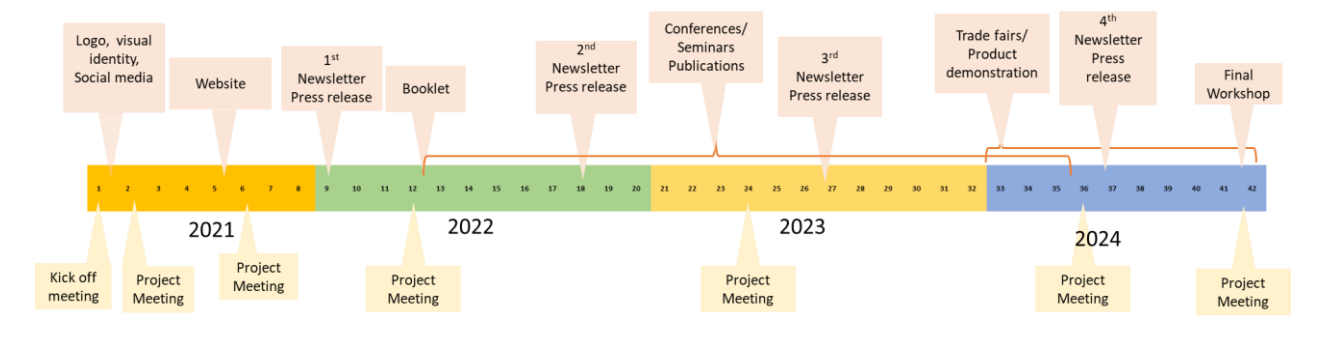
Figure 8 – LOCALNUTLEG project timeline.

A general timeline of the planned communication activities for 42 months is described below. However, an update of this timeline will be done each 6 months, with contributions from all partners indicating their individual planned activities.