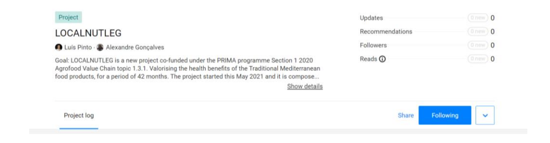
Figure 6 - Screenshot of the ResearchGate page

Use of Twitter will be focused on broadcasting relevant LOCALNUTLEG news, events and partners activity, in real-time if possible (e.g. live action of a LOCALNUTLEG partner in an external event). This social media channel is set up to provide information for relevant stakeholders.