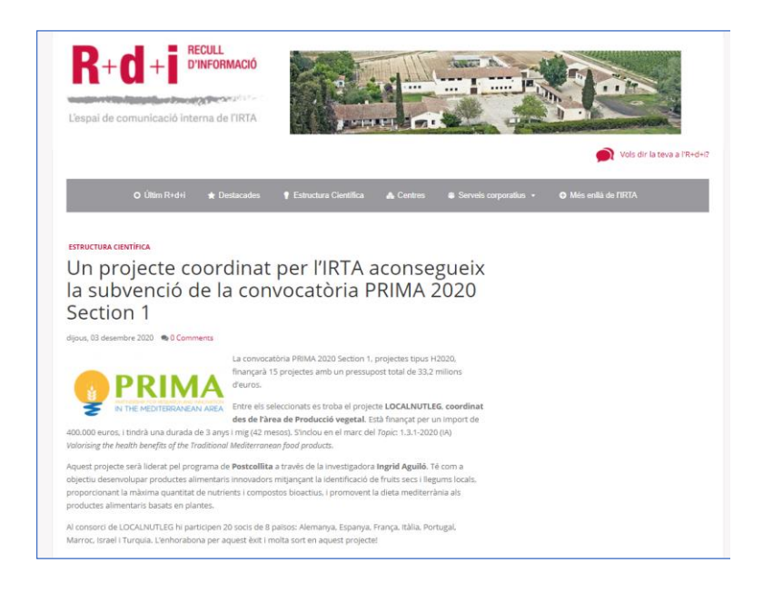
Figure 7 – Example of initial Spanish press release from IRTA

Media is known to be an effective way to reach not only stakeholders, but also the general public. The consortium will have regular contact with scientific and general press to ensure that they are informed about the project breakthroughs. The press releases will be distributed to the press contacts of the LOCALNUTLEG partners, published on the project website, and promoted via social media.