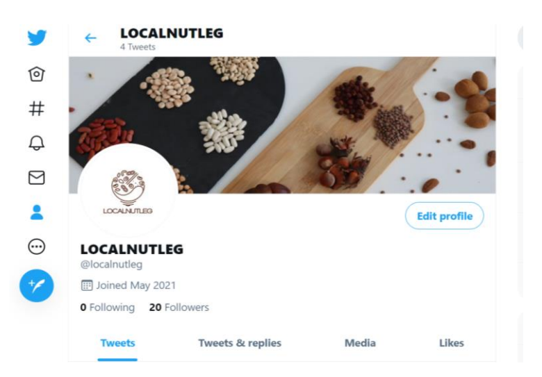
Figure 5 - Screenshot of the LOCALNUTLEG Twitter profile

Instagram profile will be used for public project communication in the form of pictures and videos of legumes and nuts, agronomic fields, production processes, farmers/producers, partner meetings, and the presence in fairs and conferences. This social media channel is set up to spread information to the general public.