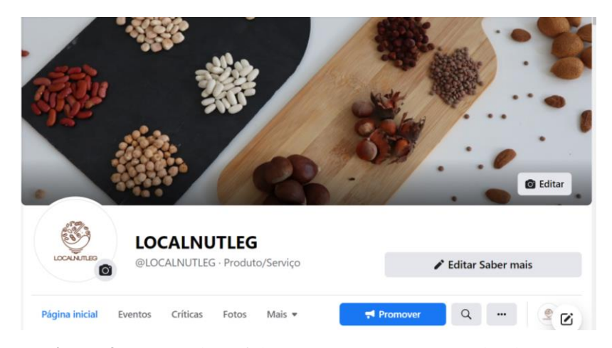
Figure 3 - Screenshot of the LOCALNUTLEG Facebook page.

LOCALNUTLEG participation in social networks aims to strengthen project visibility, promote the website, and help increase the network of contacts. So, specific Facebook (<a href="https://www.facebook.com/LOCALNUTLEG">https://www.facebook.com/LOCALNUTLEG</a>), and Twitter (<a href="https://twitter.com/localnutleg">https://twitter.com/localnutleg</a>) and Researchgate (<a href="https://www.researchgate.net/project/LOCALNUTLEG">https://www.researchgate.net/project/LOCALNUTLEG</a>) profiles of the LOCALNUTLEG project are established. All members of the consortium will share these profiles with their network of contacts on each platform. These networks will be used to disseminate the results and the main activities carried out in LOCALNUTLEG project, as well as to energize the communication with potential service claimants offered by the consortium or with people interested in the work carried out, whether researchers, industry, retailers, or consumers in general.