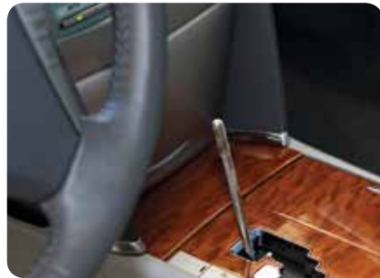
3. Missing Accessory