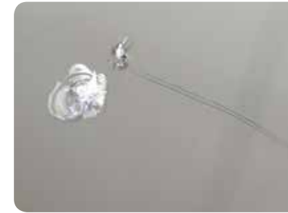
10. Damaged Windshield