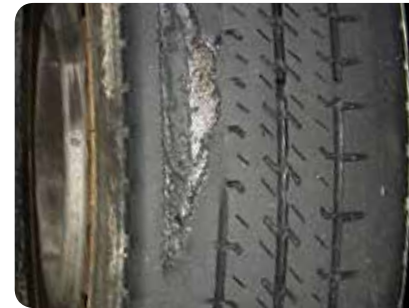
11. Exposed Tire Cord