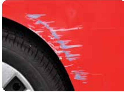
7. Scratched Panel