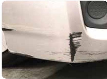
6. Scratched Bumper