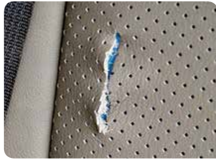
1. Cut Seat