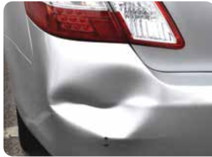
5. Dented Bumper