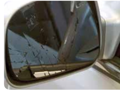
9. Broken Mirror