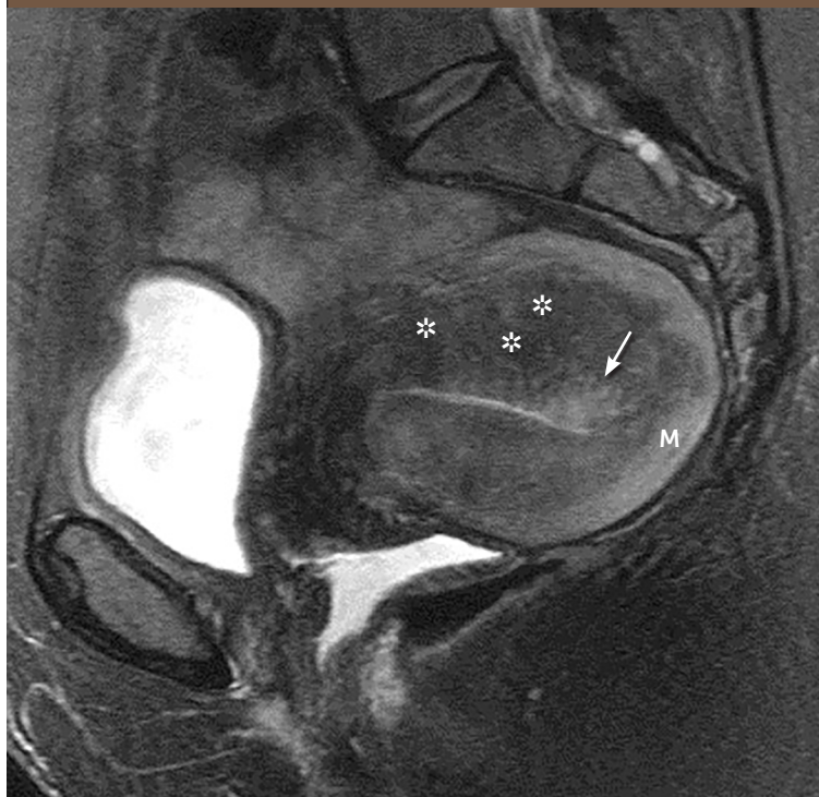
Sagittal T2-weighted magnetic resonance image with signs of adenomyosis, including a widened junctional zone (asterisks) causing thickening of the anterior and posterior myometrium and high signal related to cystic changes and edema (arrow). The normal myometrium (M) is higher in signal intensity than the darker junctional zone (asterisks).