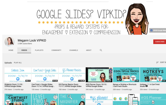
Teacher Megann - Google Slides Pro!

Here are a couple good examples of people who are branding well on youtube: