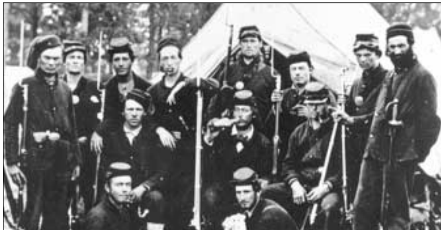
Third Michigan Infantry. Between 1861 and 1865, 90,000 Michigan soldiers served in the Civil War.