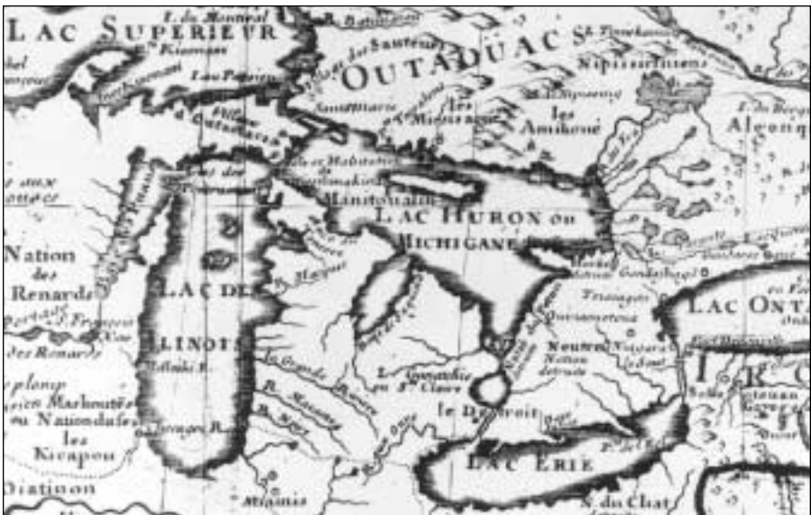
The Delisle Map. This 1703 map is thought to be the first to include Detroit.

In 1641, Father Charles Raymbault and Father Isaac Jogues preached at Sault Ste. Marie. Father René Mesnard established the first regular mission at Keweenaw Bay in 1660. Beginning in 1665, Father Claude Allouez spent twenty-five years working among the people in the Keweenaw region, Green Bay, Sault Ste. Marie, Illinois, and southwestern Michigan, where he devoted most of his efforts. Father Jacques Marquette founded the first permanent settlement in Michigan at Sault Ste. Marie in 1668 and, in 1671, founded St. Ignace. That same year, a military post was established at St. Ignace and named Fort de Buade. This fort was later abandoned, and Fort Michilimackinac was built on the southern shore of the Straits. In 1679, René Robert Cavalier de La Salle established Fort Miami at the mouth of the St. Joseph River, and by 1690, Father Claude Aveneau established a mission at the site of present-day Niles, where Fort St. Joseph was soon built.