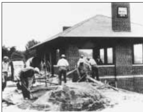
WPA projects employed thousands of displaced autoworkers.

As the "Arsenal of Democracy," Michigan played an unparalleled role in fighting tyranny abroad during World War II . Even before the nation had been drawn into the global conflict, steps had been taken to prepare the vast industrial resources of the state for conversion to war production. The state's enormous industrial capacity, bolstered by mass production techniques, was ideally suited for the industrial and technological needs of modern warfare. The auto industry, which ceased civilian automotive production altogether in February 1942, quickly converted to the production of aircraft, tanks, guns, and other materials. By the end of the war, Michigan had contributed more than 4,000,000 engines, 25,000 tanks, and 8,500 B-24 Liberator bombers to the war effort. In terms of human resources for the armed forces, more than 600,000 Michigan men and women answered their nation's call to arms. As a result, thousands of people from other states, particularly the South, and from rural Michigan flocked to the cities to meet the demand for both skilled and nonskilled labor.