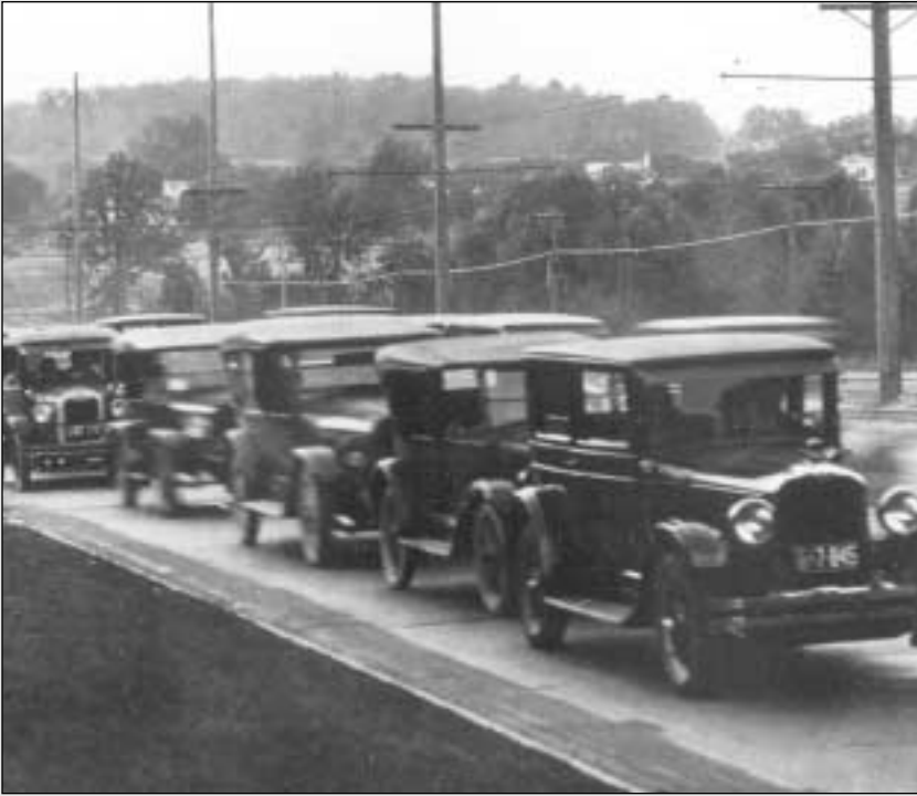
Woodward Avenue, north of Detroit, not far from the site of the world's first mile of concrete rural highway.