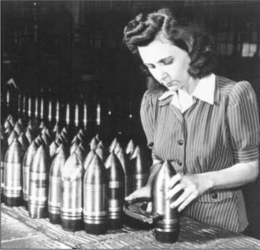
The war effort at home. Many observers trace the origins of the modern women's movement and the growth of women in the work force to their heroic contributions as civilians during World War II.