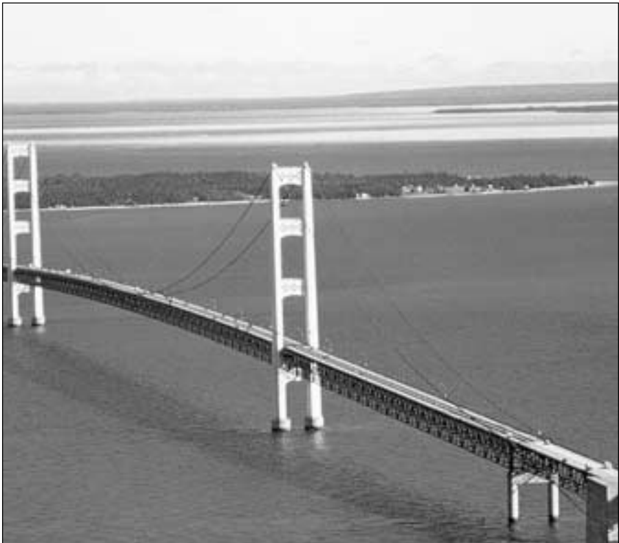
When the Mackinac Bridge opened in 1957, it represented an engineering marvel as well as the fulfillment of the dream of connecting Michigan's two great peninsulas.

The state's active promotion of overall economic development and the tourist industry also contributed to support for a bridge. An Economic Development Department was created in 1947 to coordinate efforts to strengthen and diversify the state's economy. The Michigan Tourist Council, established in 1945, promoted the state as a desirable destination for vacationers. Businesses related to the tourist industry prospered and efforts to capitalize on the growth continued. In 1950, the Mackinac Bridge Authority was reconstituted and, after the marketing of bonds to finance the project, work on the bridge began in 1954. The Mackinac Bridge officially opened on November 1, 1957, and Michigan's ultimate "internal improvement" was complete.