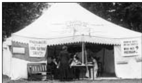
Women's suffrage movement in Michigan.

Women's rights advocates had lobbied for women's suffrage in Michigan for many years. By 1867, taxpaying women were permitted to vote in school elections. The issue of women's suffrage was debated extensively during the Constitutional Convention of 1907-1908, and the Constitution of 1908 granted taxpaying women the right to vote on questions involving the expenditure of