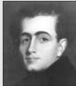
Stevens T. Mason

As Michigan prepared for statehood, Acting Governor Stevens T. Mason , who was appointed to this post at the age of nineteen by President Andrew Jackson, led the effort to assert Michigan's dominion over this area. In April 1835, Governor Mason called for volunteers and mobilized troops to go to the Toledo strip to enforce laws passed by Michigan that imposed a fine or imprisonment on anyone who contested Michigan's authority on this land. Led by Mason, who was nicknamed "the Boy Governor," the Michigan militia arrested several surveyors who were representing Ohio's interests. The actions of Governor Mason incensed President Andrew Jackson, who removed Mason from office on August 29, 1835.