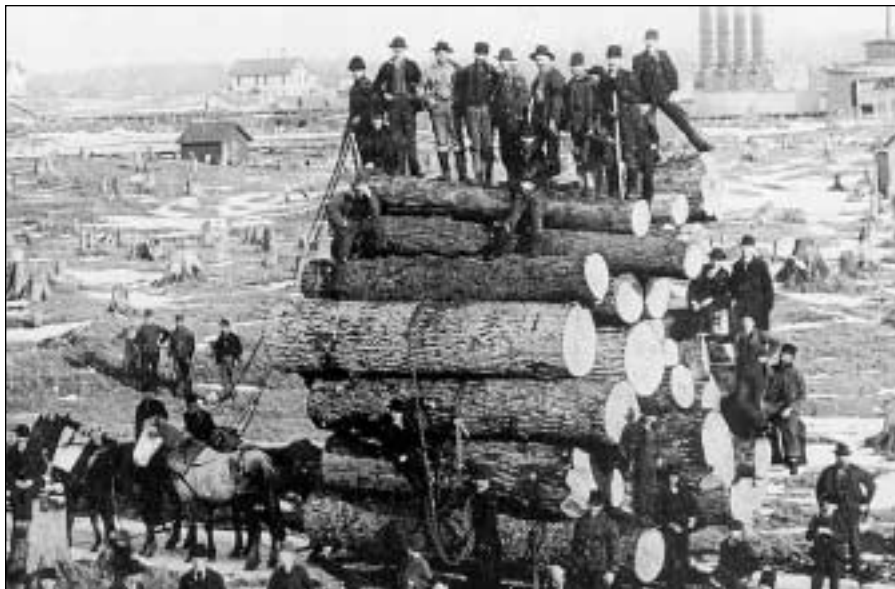
Hermansville, Michigan, in the Upper Peninsula in 1892. This photo shows the aftermath of the clear-cut logging practices of the logging boom.