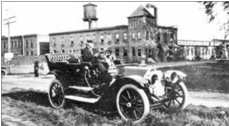
The Olds Motor Works in Lansing.