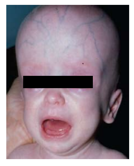
Fig. 6. Raised intracranial pressure.

These signs and symptoms are those with essentially associated raised intracranial pressure (Fig. 6). Headaches, although fairly common in children, are rarely caused by intracranial tumours. Any headache that is present for more than 2 weeks, is associated with early morning vomiting or co-ordination difficulties, needs to be further evaluated as a matter of urgency. Sudden onset of squints, ataxia and changes in behaviour may all be signs and symptoms of serious intracranial disease. Loss of milestones, enlarging head circumference associated with splaying of the sutures, sunset eye sign and prominent veins on the head may all be signs of raised intracranial pressure. These children need urgent and rapid evaluation by means of CT or MRI scans.