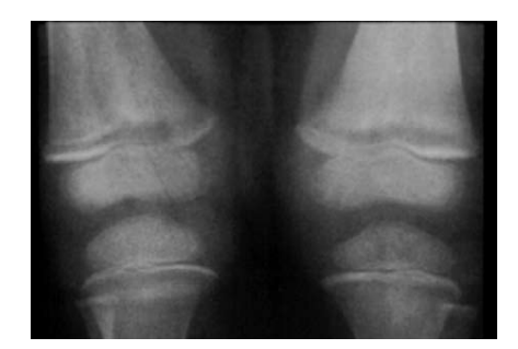
Fig. 3. Bone changes with acute leukaemia.

signs such as swelling, tenderness or redness must be further investigated and malignancies must be considered. In 20 -30% of patients with leukaemia bone pain (Fig. 3) may be the presenting symptom, while up to 60% may have musculoskeletal symptoms or signs. Backache in children must be taken seriously as children seldom complain of it unless there is a reason, so that full evaluation for the possible cause must be undertaken. Spinal and vertebral tumours and bone infiltrations may all present with backache. Many tumours spread to the bone and can cause bone pain, including retinoblastoma, histiocytosis, rhabdomyosarcoma and neuroblastoma.