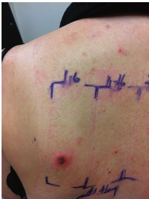
Figure 3. MOISTURE-ASSOCIATED DERMATITIS: DIFFERENT CLINICAL PRESENTATIONS

• Peristomal-associated skin damage may be due to ileostomy, colostomy, or urostomy and associated stool or urine coming in contact with skin. This dermatitis requires containment of the stool or urine with a better fit of the collection bag or alteration of the stoma.