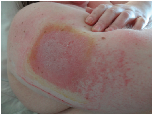
Figure 1. ALLERGIC CONTACT DERMATITIS: A WELL-DEMARCATED ERYTHEMATOUS PLAQUE DUE TO CONTACT DERMATITIS TO DRESSING

allergic to bacitracin, and 7.2% to 13.1% of patch-tested patients older than 20 years have allergic sensitization to neomycin. 3-5