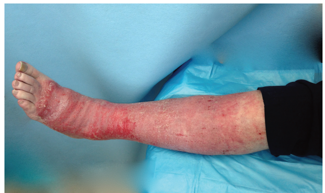
Figure 2. ALLERGIC CONTACT DERMATITIS: DIFFUSE ALLERGIC REACTION TO ZINC OXIDE IN COMPRESSION WRAP

A 2007 study 9 of 30 disease-free participants compared transepidermal water loss and irritancy from 6 common wound care dressing products applied to the same area of skin, 6 times over a 14-day period. The dressings with lower irritancy in this study were soft silicone-faced polyurethane foam dressing, polyurethane foam self-adhesive island dressing, soft hydrophilic polyurethane foam dressing, polyurethane foam dressing, hydrocolloid semipermeable polyurethane dressing, and hydrocolloid semipermeable dressing. Also, soft silicone-faced polyurethane foam dressings, polyurethane foam self-adhesive island dressings, and soft hydrophilic polyurethane foam dressings had low mean transepidermal water loss values closer to that of normal skin. Based on this study, those 3 foam dressings may