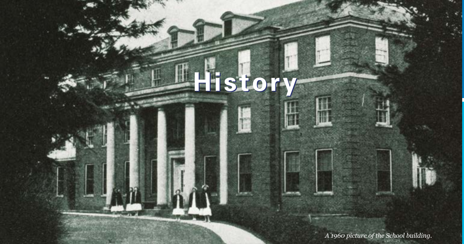
A 1960 picture of the School building.