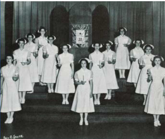
Class of 1944 Muhlenberg School of Nursing

The School was founded in 1894. Since that time it has maintained a level of excellence in nursing education worthy of the reputation that it holds. Further, in 1971, by a Resolution of the Board of Higher Education of New Jersey, the School of Nursing was given unconditional approval to institute a Cooperative Program with the, then private, Union College of Union County NJ (Union College)