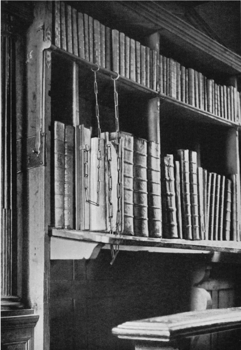
FIGURE 3. The most valuable books in medieval college libraries, usually large folios, were often chained and could be read only on a narrow desk below. This half-press in the library of Merton College, Oxford, retained a number of chained volumes well into the twentieth century.