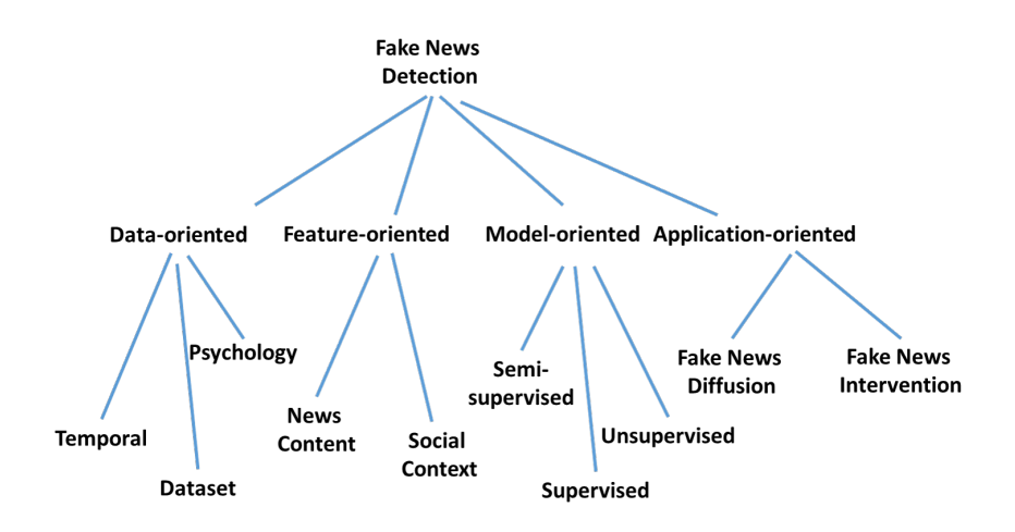
Figure 2: Future directions and open issues for fake news detection on social media.