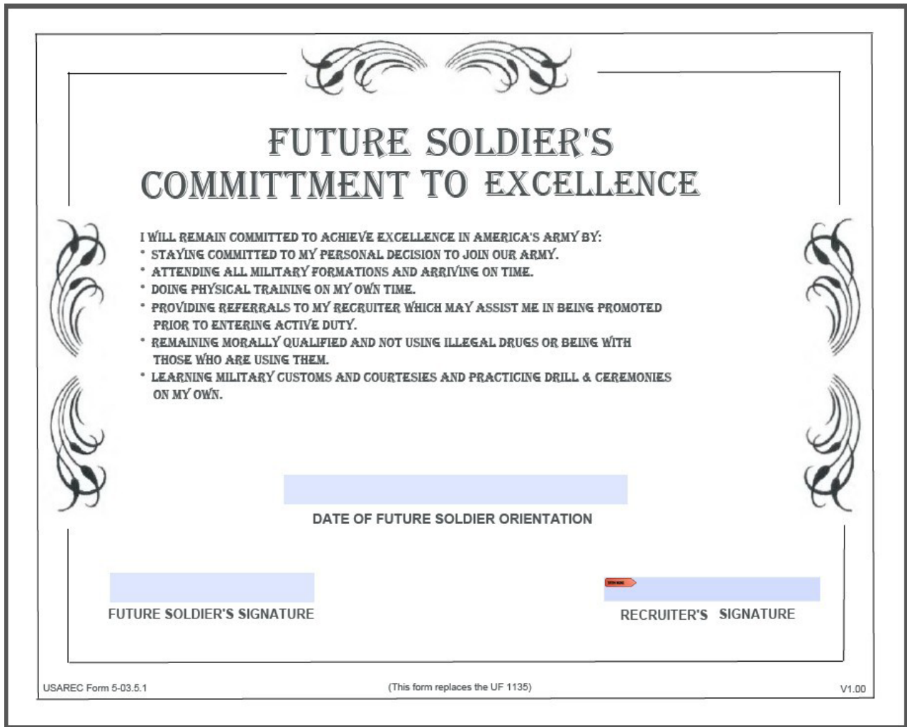
Figure C-1. Future Soldier Commitment to Excellence Certificate