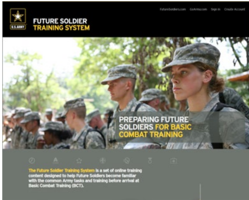
Figure 3-1. Army Game Hub Website.

3-6. The Required Training (Basic Training Task List (BTTL) - required for advanced enlistment rank), is on the “Required Training” Tab. These classes prepare the Future Soldier for the challenges they will face in IMT. The BTTL tasks include: