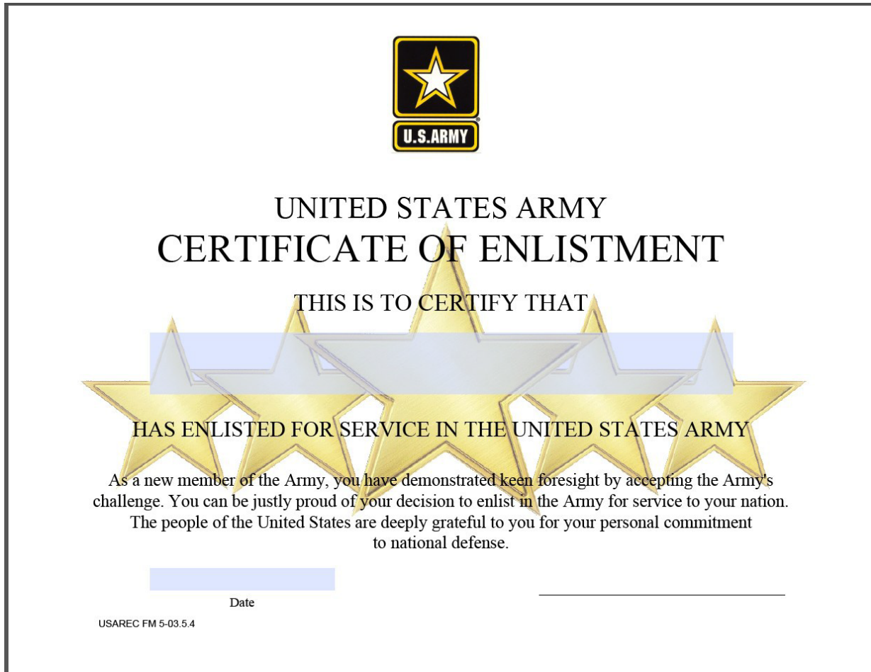
Figure C-5. Example UF 5-03.5.4 – Certificate of Enlistment

Keep in mind when presenting these certificates that these are the first certificates of the Future Soldier's career. Present them in a way the Future Soldier and family members will remember and want to display for years. This means that the certificates should be printed in color on marbled or colored cardstock paper. If the station does not have these capabilities, utilize the company or battalion to develop a system to generate certificates worthy of presentation. The UF 589 (old Certificate of Enlistment) may be used until inventory is exhausted by submitting a DA Form 17 to the USAREC G-6 Publications Branch at: usarmy.knox.usarec.mbx.hq-g6-publications@army.mil .