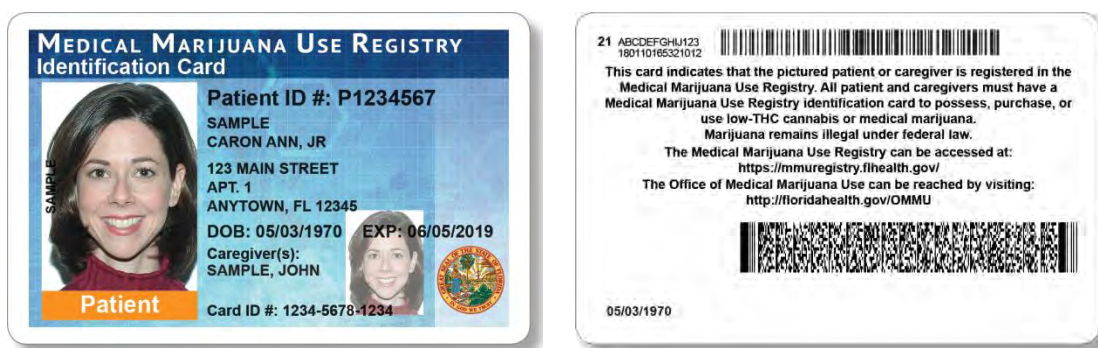
Figure 1: 2015 Sample Patient Medical Marijuana Use Registry Identification Card

Figure 1 is a sample patient use registry ID card from 2015. It shows the original name of the registry (Compassionate Use Registry) and the original name of the Office of Medical Marijuana Use (Office of Compassionate Use.) The caregiver use registry ID cards are similar in appearance to the patient use registry ID cards but contain additional information about the patient or patients the caregivers assist.