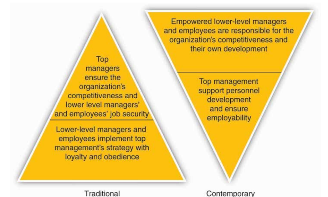
Figure 1.3 The Changing Roles of Management and Managers

A general manager is someone who is responsible for managing a clearly identifiable revenue-producing unit, such as a store, business unit, or product line. General managers typically must make decisions across different functions and have rewards tied to the performance of the entire unit (i.e., store, business unit, product line, etc.). General managers take direction from their top executives. They must first understand the executives' overall plan for the company. Then they set specific goals for their own departments to fit in with the plan. The general manager of production, for example, might have to increase certain product lines and phase out others. General managers must describe their goals clearly to their support staff. The supervisory managers see that the goals are met.