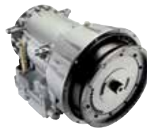
3000 TRV, 3200 TRV

Truck-Based Recreational Vehicles Class 6–8 Type C Motorhomes