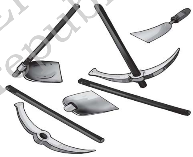
Fig. 6.6 Tools are often heated before fixing wooden handles

The iron blade of these tools has a ring in which the wooden handle is fixed. Normally, the ring is slightly smaller in size than the wooden handle. To fix the handle, the ring is heated and it becomes slightly larger in size (expands). Now, the handle easily fits into the ring. When the ring cools down it contracts and fits tightly on to the handle.