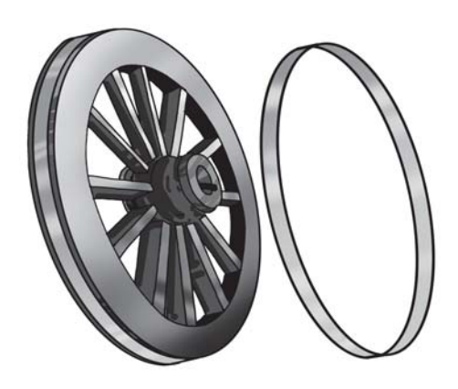
Fig. 6.7 Cart wheel with metal rim fixed to it

When we heat water in a pan, it begins to boil after some time. If we continue to heat further, the quantity of water in the pan begins to decrease.