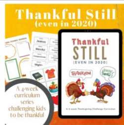
Thankful Still (even in 2020) 4-Week Sunday School Curriculum $45

If your church buys resources, please consider using The Sunday School Store . Church budgets are tight. That's why our digital curriculum is half the cost of printed material. Even when finances are limited, your teaching can make an eternal difference.