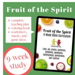
"The Fruit of the Spirit" 9 Unit Curriculum for Kids $57 $90