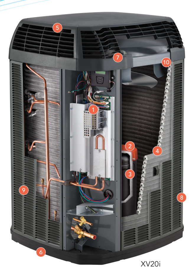
Features and components may vary by model and are shown for illustration purposes only. As part of our continuous product improvement, Trane reserves the right to change specifications and design without notice.

At the heart of every Trane air conditioner, you'll find a Climatuff® compressor that's been tested in some of the most brutal conditions on earth. Because that's what it takes to be a Trane.