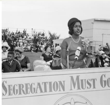
Merlie Evers Speaking at Microphone August 25, 1963, Washington, DC. Merlie Evers, widow of the slain integrationist leader Medgar Evers, is shown addressing a National Association for the Advancement of Colored People (NAACP) Freedom Rally at Howard University.