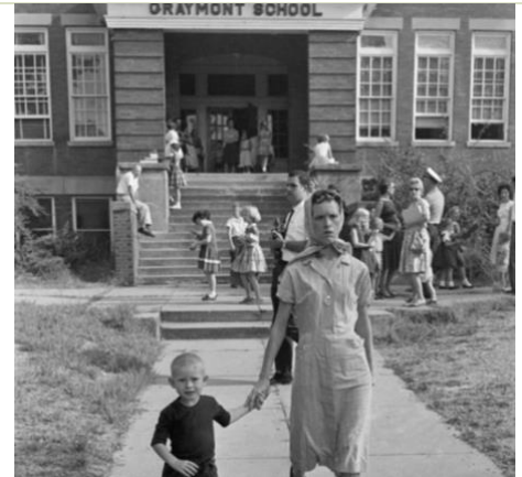
Mother Removing Child from Desegregated School September 16, 1963, Graymont School, Birmingham, AL. A young child walks with his angry mother as she removes him from Graymont School in Birmingham, which has just become desegregated.