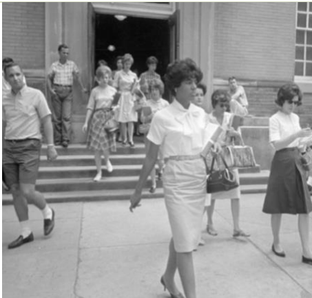
Vivian Malone Leaving Class June 12, 1963, Tuscaloosa, AL. Vivian Malone, one of the first African-American students to attend the University of Alabama, exits a building on campus where she attended her first class.