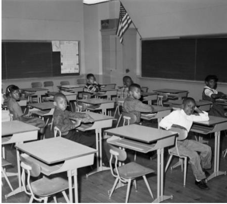
Nearly Empty Desegregated School September 5, 1962, Englewood, NJ. African-American students sit in a nearly empty classroom in newly desegregated Lincoln School during a boycott by students protesting desegregation.