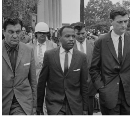
James Meredith Ole Miss Integration October 1, 1962, Mississippi. James Meredith walking to class at Mississippi University accompanied by U.S. marshals.