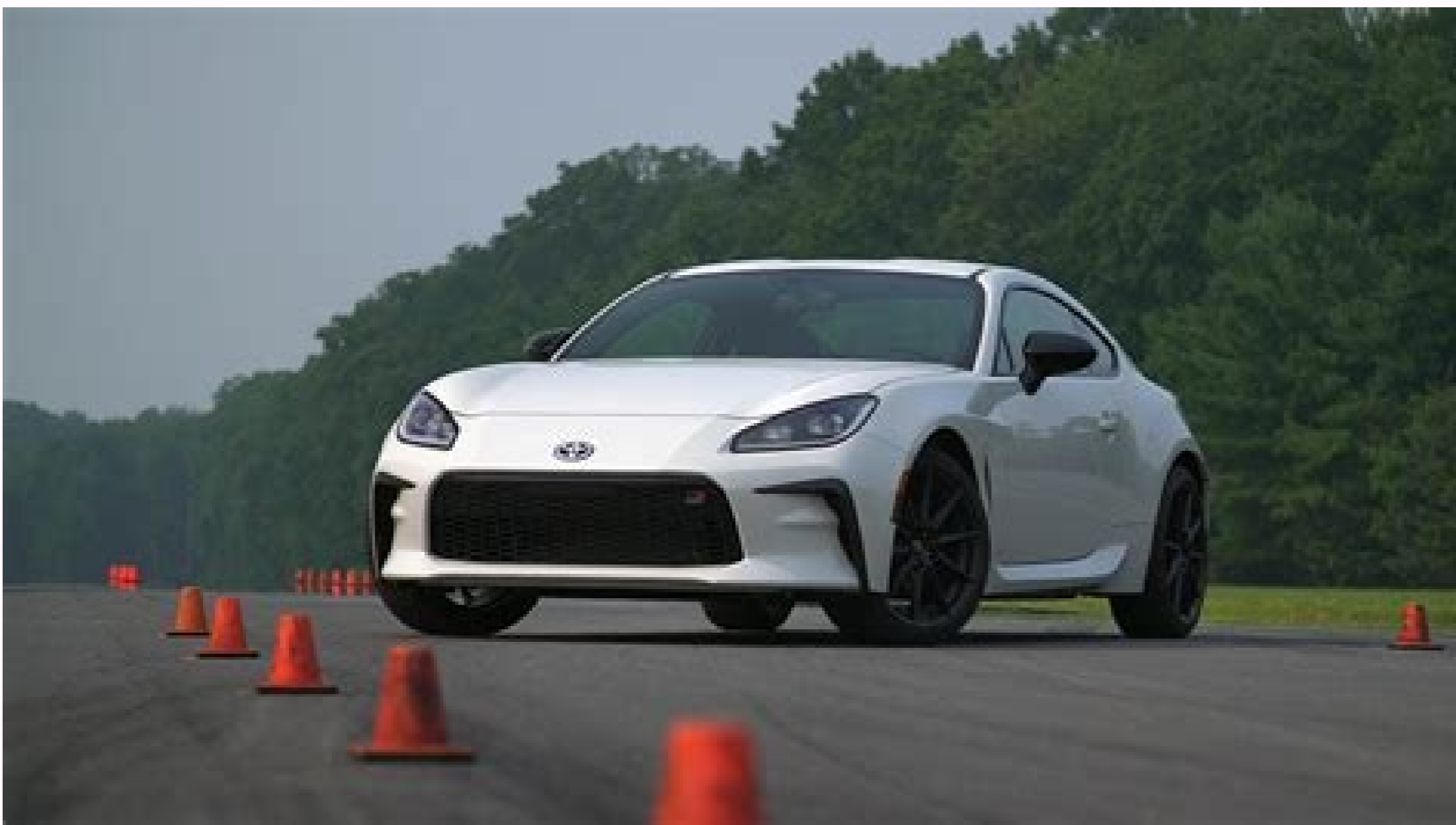
Best luxury suv 2019 consumer reports. Best luxury cars consumer reports.