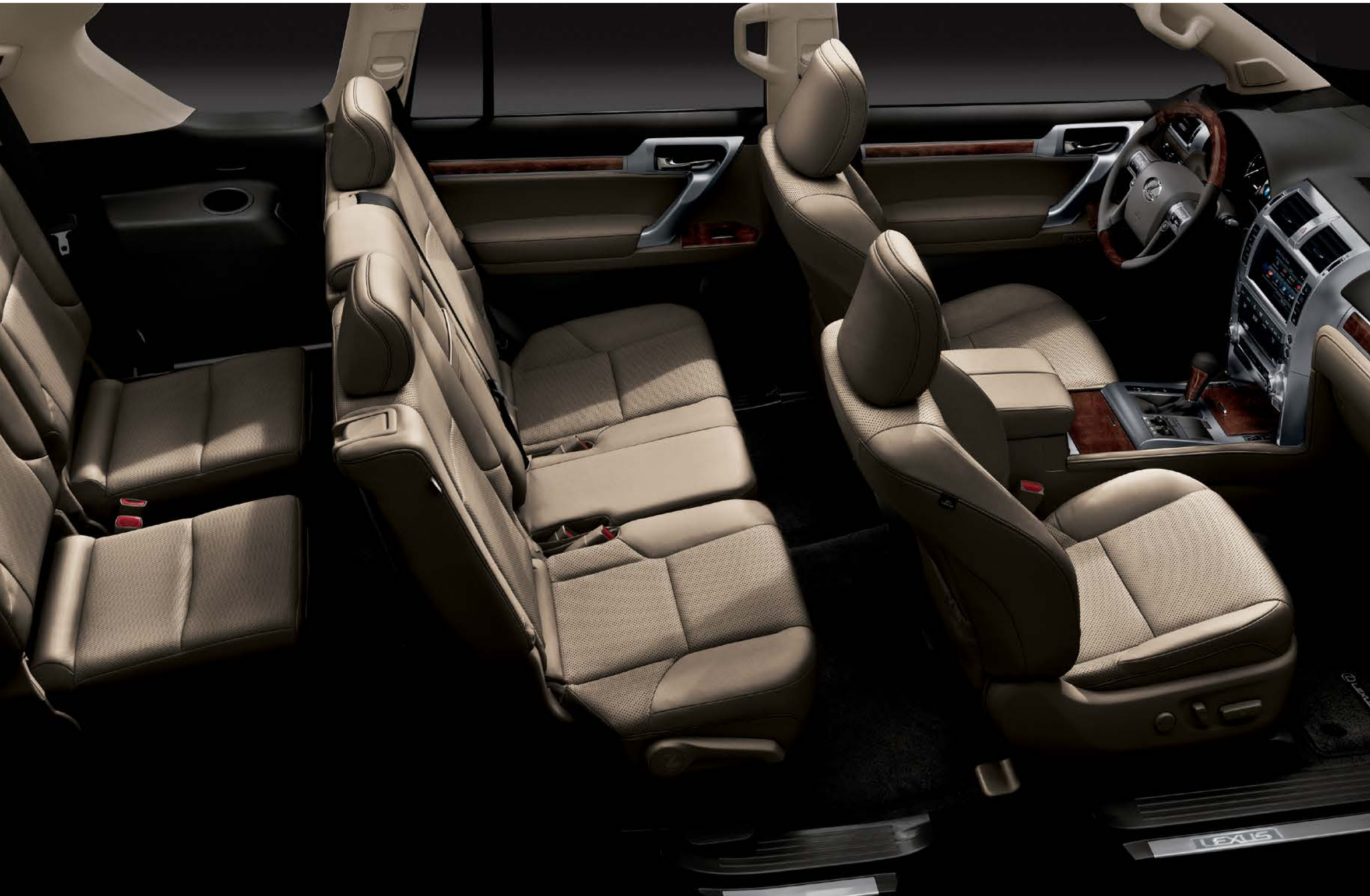
GX shown with available Sepia NuLuxe ® and Mahogany wood interior trim // Options shown