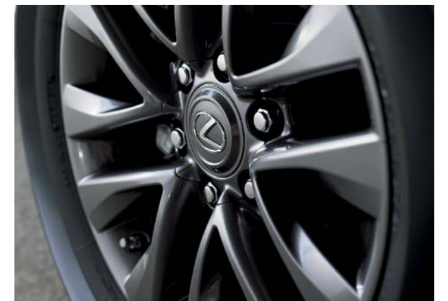
GX shown in Silver Lining Metallic // Options shown

— Designed to the highest and most exact standards. Ours.