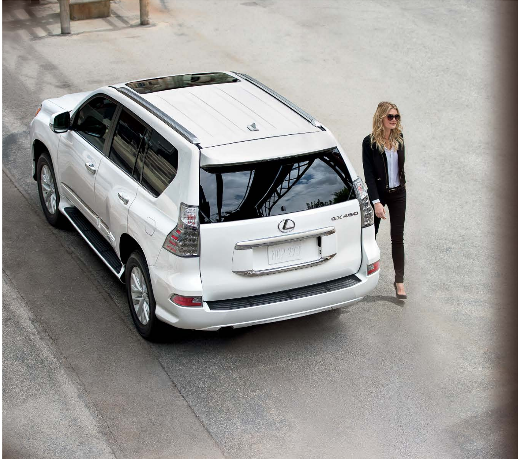
GX shown in Starfire Pearl // Options shown