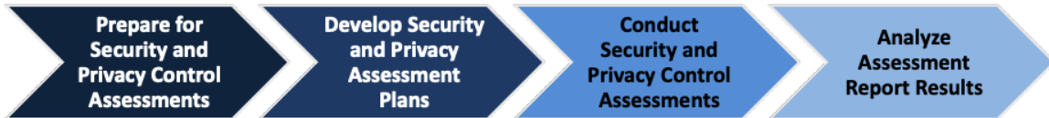
FIGURE 7. OVERVIEW OF PROCESS TO CONDUCT EFFECTIVE SECURITY AND PRIVACY CONTROL ASSESSMENTS

Additionally, this chapter describes assessing security and privacy capabilities . 27