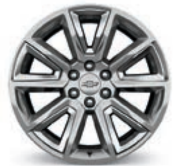
22" Premium Painted-Aluminum with Chrome Inserts (SGF) (Available on LT and Premier)