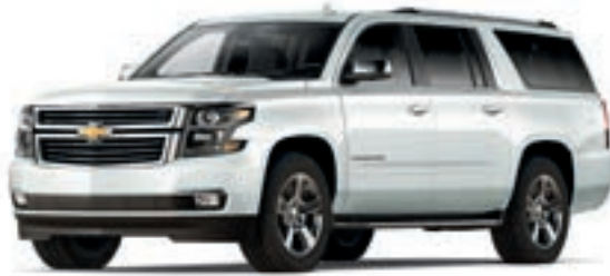
IRIDESCENT PEARL TRICOAT 2