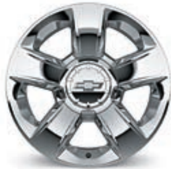
20" Chrome-Aluminum (RD2) (Available on Premier; included with LT Signature Package)