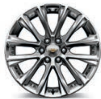
22" 12-Spoke Aluminum with Polished Finish (SH0) (Included with Premier Plus Edition)