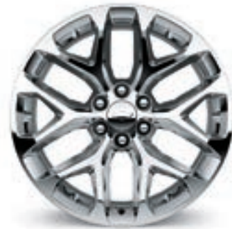
22" Chrome-Aluminum Multi-Featured Design (RPT) (Available on LT and Premier)