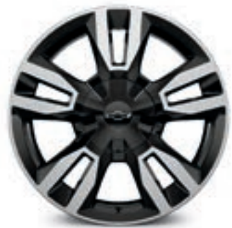
22" Gloss Black-Painted Aluminum with Custom Silver Accents (SGK) (Included with RST Edition)