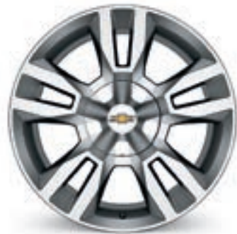
22" Bright Machined-Aluminum with Bright Silver Finish (SIY) (Available on Premier)