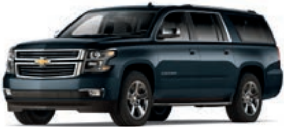
SHADOW GRAY METALLIC