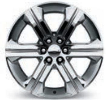
22" Chrome-Aluminum (SMI) (Available on LT and Premier)