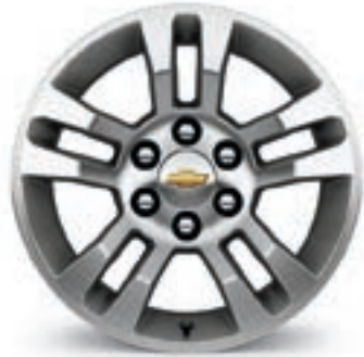
18" Aluminum with High-Polished Finish (PZX) (Standard on LS and LT)