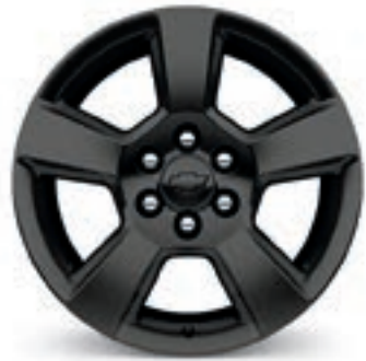
20" Black-Painted Aluminum (NZQ) (Included with LT Midnight Edition)