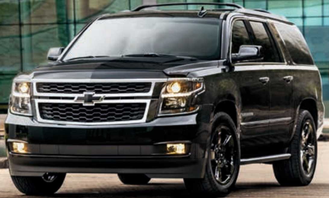
Suburban LT in Black with available LT Midnight Edition.