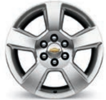
20" Polished-Aluminum (RD4) (Standard on Premier; available on LS and LT)