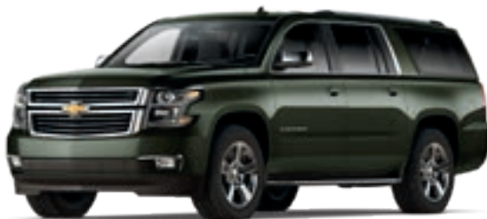
DEEPWOOD GREEN METALLIC 3