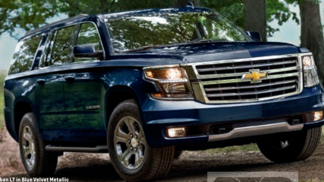
Suburban LT in Blue Velvet Metallic with available Z71 Off-Road Package.