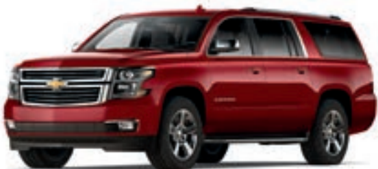
SIREN RED TINTCOAT 1