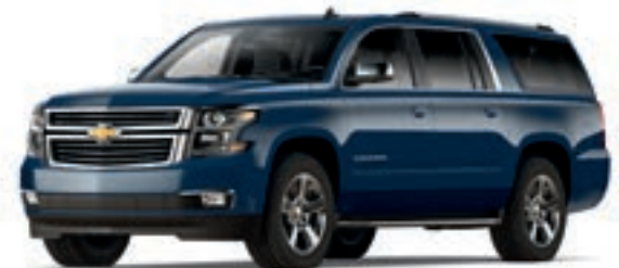
BLUE VELVET METALLIC