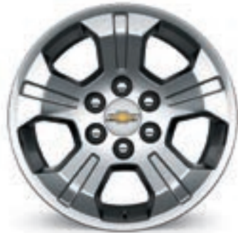
18" Painted-Aluminum (RCV) (Included with Z71 Off-Road Package)