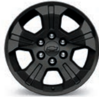
18" Black-Painted Aluminum (REG) (Included with Z71 Midnight Edition)