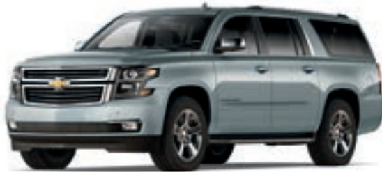
SATIN STEEL METALLIC