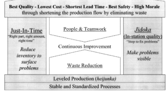
Figure 6, The house of lean (Liker and Morgan, 2006)

Establishing standardized processes and procedures is the foundation for consistent lean performance (Deflorin and Scherrer-Rathje, 2012; Liker and Morgan, 2006). According to Boyer and Sovilla (2003) the most important implementation issue is rushing to a solution without a principled base. Like a house that needs to be built from the ground up, lean also first needs a