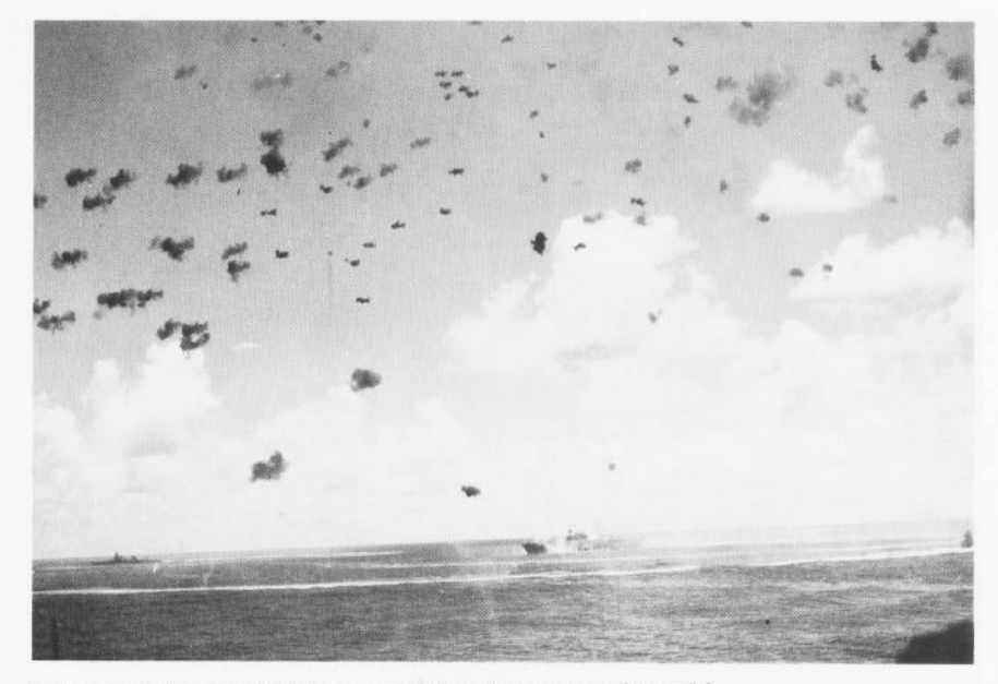
The carrier task force could take care of itself...