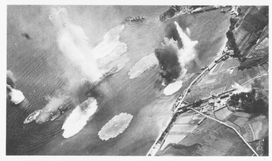
... and launch concentrated attacks...