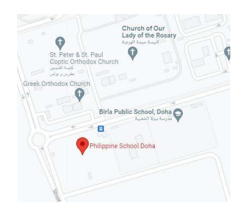
Fig. 1. (a) Map of Qatar; (b) Location of Philippine School Doha

Philippine School Doha is known to be the leading basic learning institution in Qatar. The school is a non-stock non-profit community school that has been serving the Filipino community in Qatar since 1992. The participants for this study were chosen following the criteria set: (1) should be 14-20 years old; (2) spent at least 4 or more years with grandparents; (3) lived with grandparents in the Philippines. The criteria set was followed and observed to get and understand the participants' lived experiences being raised by their grandparents.