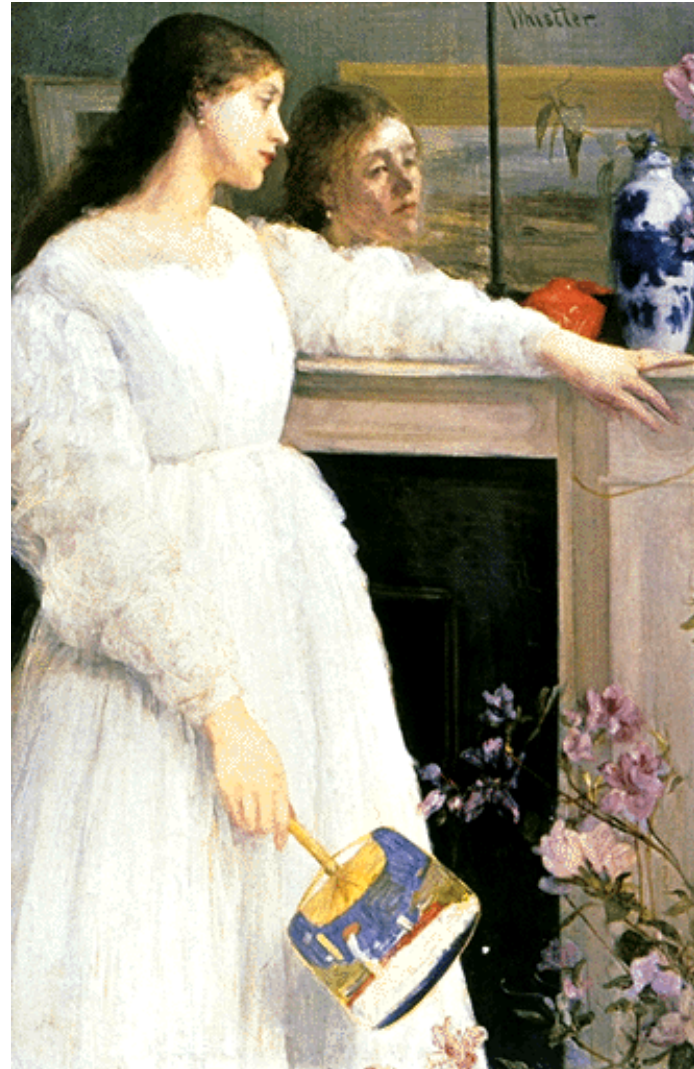
James Whistler, girl in white with a Japanese fan