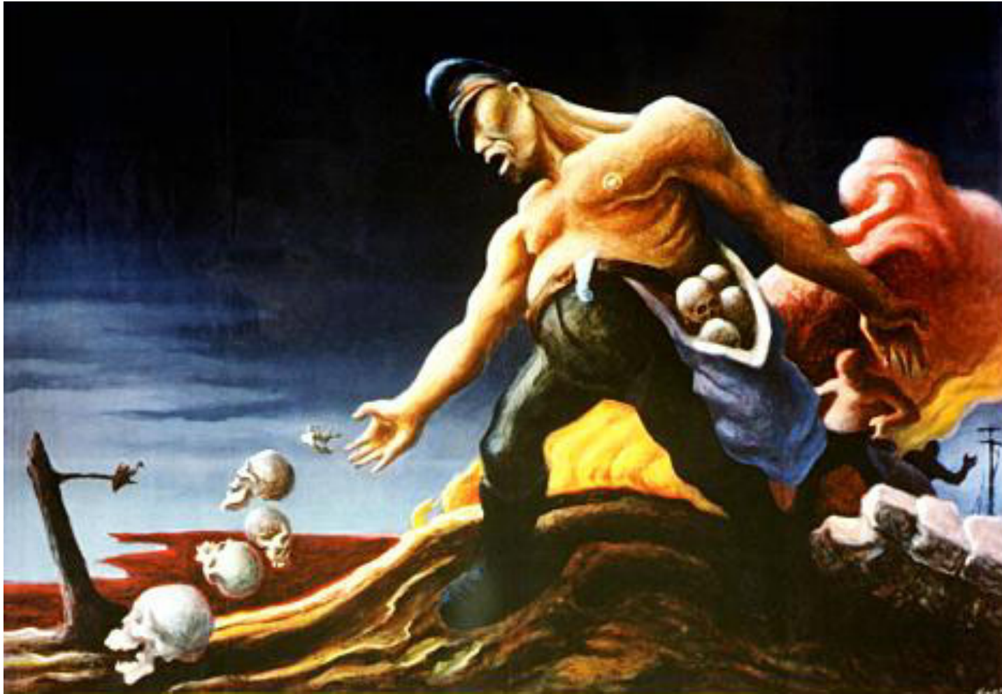
Benton, Thomas Hart The Sowers 1942