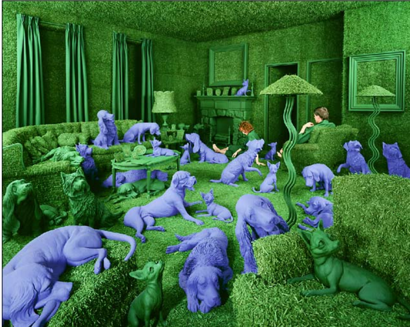
Skoglund, Sandy Green House 1980