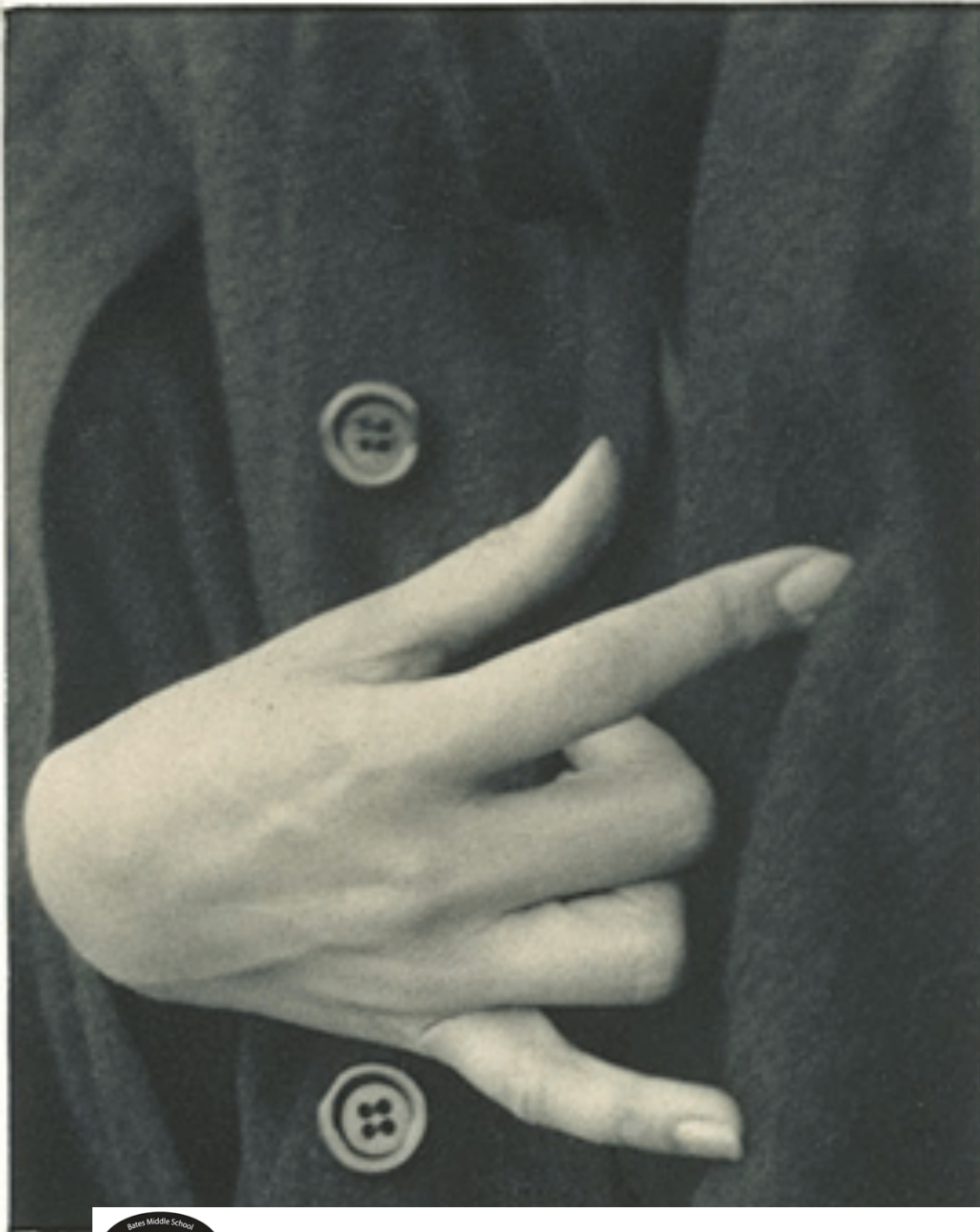
Steiglitz, Alfred Okeefe Hand 1918