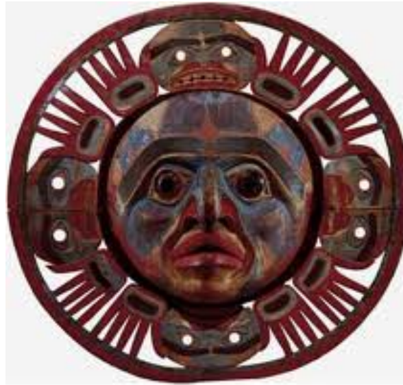
Bella Coola mask, British Columbia (before 1897). Wood