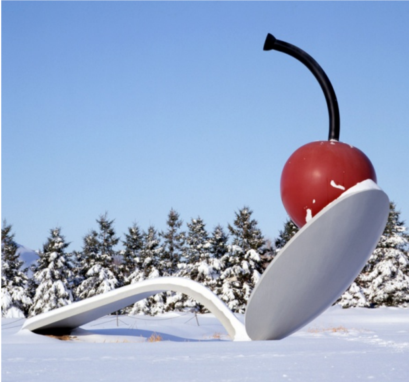
Claes Oldenburg & Coosje van Bruggen, Spoonbridge and Cherry, 1985-1988