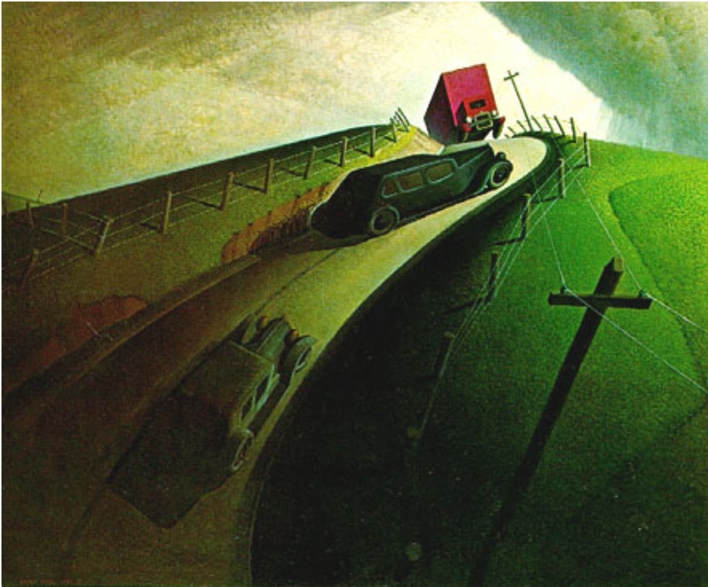
Wood, Grant Death on Ridge Road 1938