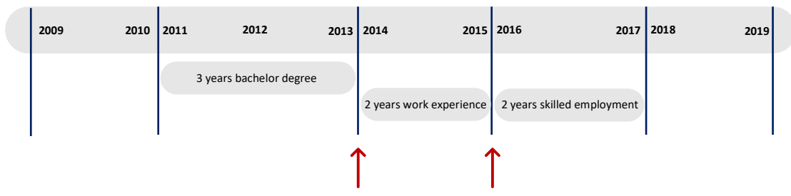
3 years bachelor completed skills level requirement met date