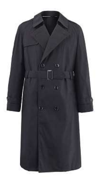
Figure 3501.1a-1 All-Weather Coat, Double Breasted (Males)