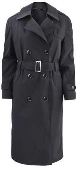
Figure 3501.1a-2 All-Weather Coat, Double Breasted (Females)