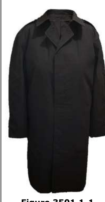
Figure 3501.1-1 All-Weather Coat, Single Breasted