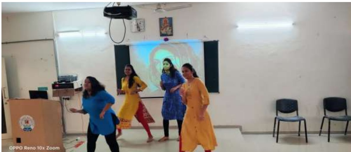
Dance performance has been given by the student of 2 nd Year Pharm.D.