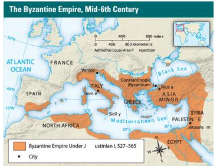
The eastern Roman Empire, later called the Byzantine Empire, ruled much of the Mediterranean world for several hundred years.

Almost everyone attended the exciting chariot races at a stadium called the Hippodrome. Two chariot teams, one wearing blue and the other green, were fierce rivals. In Constantinople and other cities, many people belonged to opposing groups called the Blues and Greens after the chariot teams. At times the rivalry between Blues and Greens erupted in deadly street fighting. But in 532, the two groups united in a rebellion that destroyed much of Constantinople. You will find out what happened in the next section.