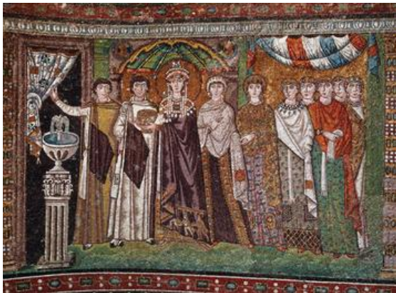
During a revolt in Constantinople, the empress Theodora (third from the left) encouraged her husband, Justinian I, to stay and fight for his city.