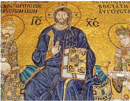
Byzantine emperor Leo III banned the use of religious images, or icons, in 730 C.E. The ban was lifted in 843. This mosaic of Jesus in Hagia Sophia escaped destruction because it was created after the ban was lifted.

Other differences added to the conflict. Let's look at three major disagreements and how they led to a split in the Christian Church.