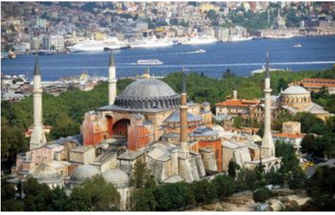
Hagia Sophia was built between the years 532 and 537. Its architectural features inspired the design of many later Orthodox churches.

To the Byzantines, Christianity was more than a religion. It was the very foundation of their empire.