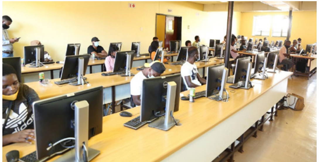
Attendees of 2021 Agritour ZA Limpopo innovation platform during one of their sessions