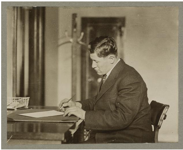
"Jim Thorpe, the olympic hero//Photograph shows Jim Thorpe, half-length portrait, facing left, sitting at a desk, writing. c1913 Mar. 27."

Jim Thorpe came back to Rocky Mount in 1910 for another summer of baseball. Despite a sore arm, he continued to pitch, in addition to playing outfield. Late in the season he was traded to Fayetteville. Thorpe became as popular with the fans in Fayetteville as he had been in Rocky Mount. According to one story, he won a bet and delighted numerous Fayetteville observers by running headfirst through a restaurant window. However, Thorpe did not get along with his Fayetteville manager and did not come back to North Carolina after the 1910 season.