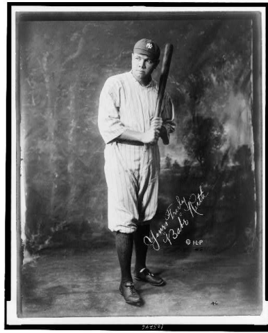
"[Babe Ruth, full-length portrait, standing, facing slightly left, in baseball uniform, holding baseball bat]

the names Buzzards and Sparrows. Ruth was a Buzzard. His team won the c1920." game 15 to 9. He hit a long home run, described by Fayetteville residents as the longest home run they had ever seen. Ruth recalled that "I hit it as I hit all the others, by taking a good gander at the pitch as it came up to the plate, twisting my body into a backswing, and then hitting it as hard as I could swing."