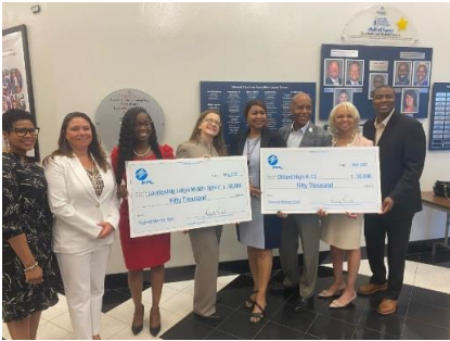
Lauderdale Lakes Middle School, Dillard High 6-12, and FPL NextEra Staff