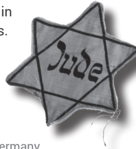
This example of a Jewish badge was worn by Jews in Germany. Jude is the German word for Jew. The badges varied slightly among German-occupied countries where local words for Jew were used (e.g., Juif in French, Jood in Dutch).

When Germany invaded Poland on September 1, 1939, millions of Polish Jews were brought under Nazi rule. The following year, German forces continued their victorious march into much of Europe, taking Denmark, Norway, Holland, Belgium, Luxembourg, and France. In each country the Nazis conquered, Jews were forced to wear a Jewish badge (using the Star of David) in public to be easily identified and were later isolated in ghettos. Conditions in these ghettos were horrendous; thousands died daily of starvation and disease. Still, the process was taking too long to suit the Nazis. By 1941, making Europe “Judenrein,” free of Jews, became a top Nazi priority.