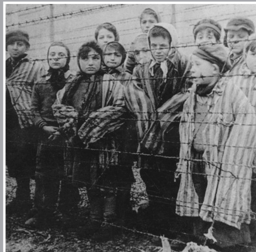
Child survivors of Auschwitz. They were liberated from the Auschwitz concentration camp by the Red Army January, 1945.