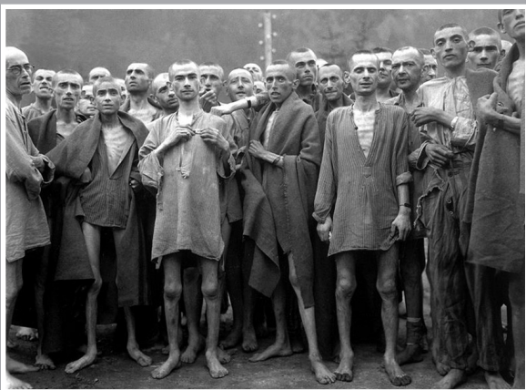
Starved prisoners, nearly dead from hunger, pose in concentration camp in Ebensee, Austria. The camp was reputedly used for "scientific" experiments. It was liberated by the 80th Division.