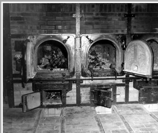
Bones of anti-Nazi German women still in the crematoriums in the German concentration camp at Weimar (Buchenwald), Germany, taken by the 3rd U.S. Army, April 14, 1945.

Anti-Semitism and support for Nazism were not limited to Germany and Germans. Non-German paramilitary forces, mobs, and individuals were also responsible for the murder of many of the Jews swept away in the Holocaust. In Romania, the pro-Nazi “Iron Guard” and, in Lithuania, the “Iron Wolf” murdered thousands. Polish and Lithuanian mobs were responsible for killing many Jews. “Hiwis” or Ukrainian auxiliaries that operated under the control of the Germans participated in the liquidation of the ghettos and the subsequent massacres. Thousands were beheaded in Croatian concentration camps by Croatian military units, approximately 20,000 in the Jasnow camp alone.