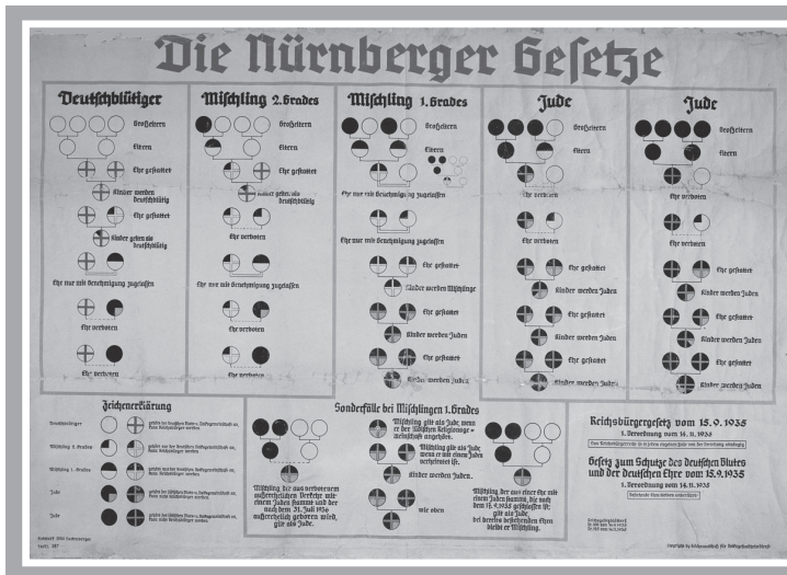
1935 chart from Nazi Germany used to explain the Nuremberg Laws, which employed a pseudo-scientific basis for racial identification.

Under the banner “The Jews are our misfortune,” between 1933 and 1939 the Nazi State legislated restrictions against Jews designed to force them out of Germany’s economic, political, and social life. All non-Aryans (who had Jewish parents or two or more Jewish grandparents) were expelled from the civil service. In 1933, the government called for a general boycott of all Jewish-owned businesses and passed laws excluding Jews from journalism, radio,