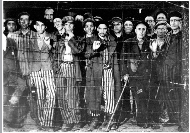
Margaret Bourke-White's photograph of the "living dead of Buchenwald," April 13, 1945. Concentration survivors liberated by American forces. © Time & Life Pictures/ Getty Images.