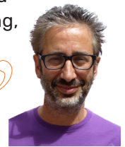
DAVID BADDIEL, patron of Humanists UK

'I am an atheist, and this confuses some people... For me, Jewishness, and I would say for an awful lot of Jews, is nothing to do with believing in God... For me, Jew is an identity. It's an ethnic and cultural identity, which I feel very strongly... My Jewish identity is to do with food, and comedy, and family, and literature, and a way of being, and, incredibly importantly, anti-semitism.'