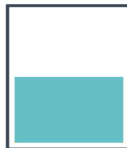
HALF PAGE Type area - 18.5 cm x 11.5 cm Trim size - 21 cm x 13.5 cm Bleed size- 21.6 cm x 14. cm