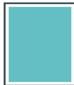
FULL PAGE Type area - 18.5 cm x 21.9 cm Trim size - 21 cm x 27 cm Bleed size- 21.6 cm x 27.6 cm