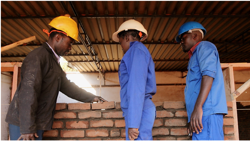
TEVET trainees learn bricklaying skills

Information on the new TMIS for TEVET Principals