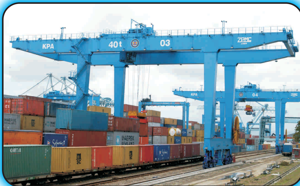
Shorehandling rail bound containers