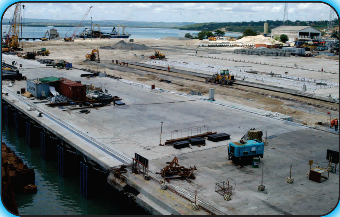
Development of Berth 19 Dec 2012