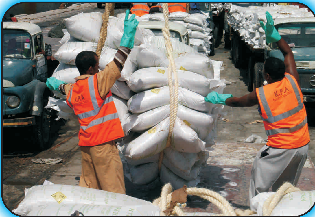
Labour hired for handling loose cargo