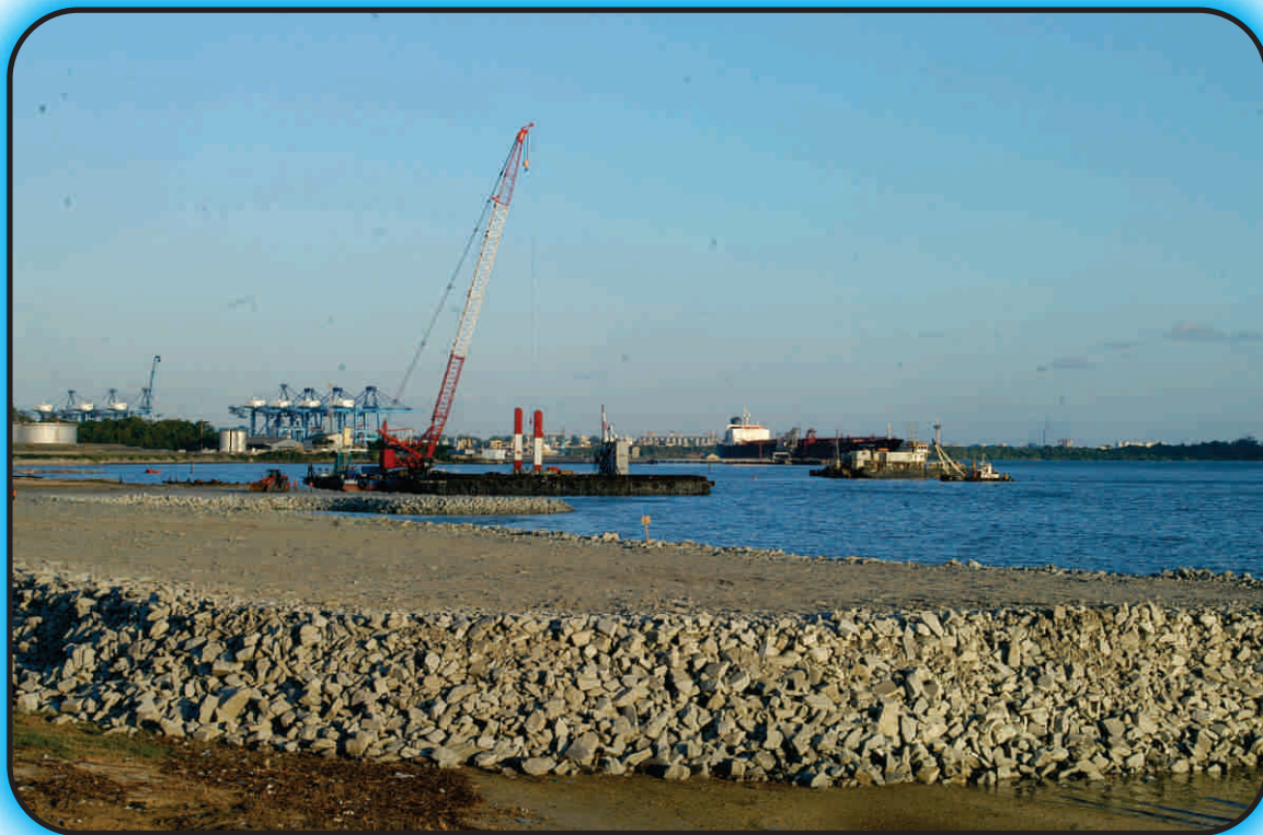
Second Container Terminal