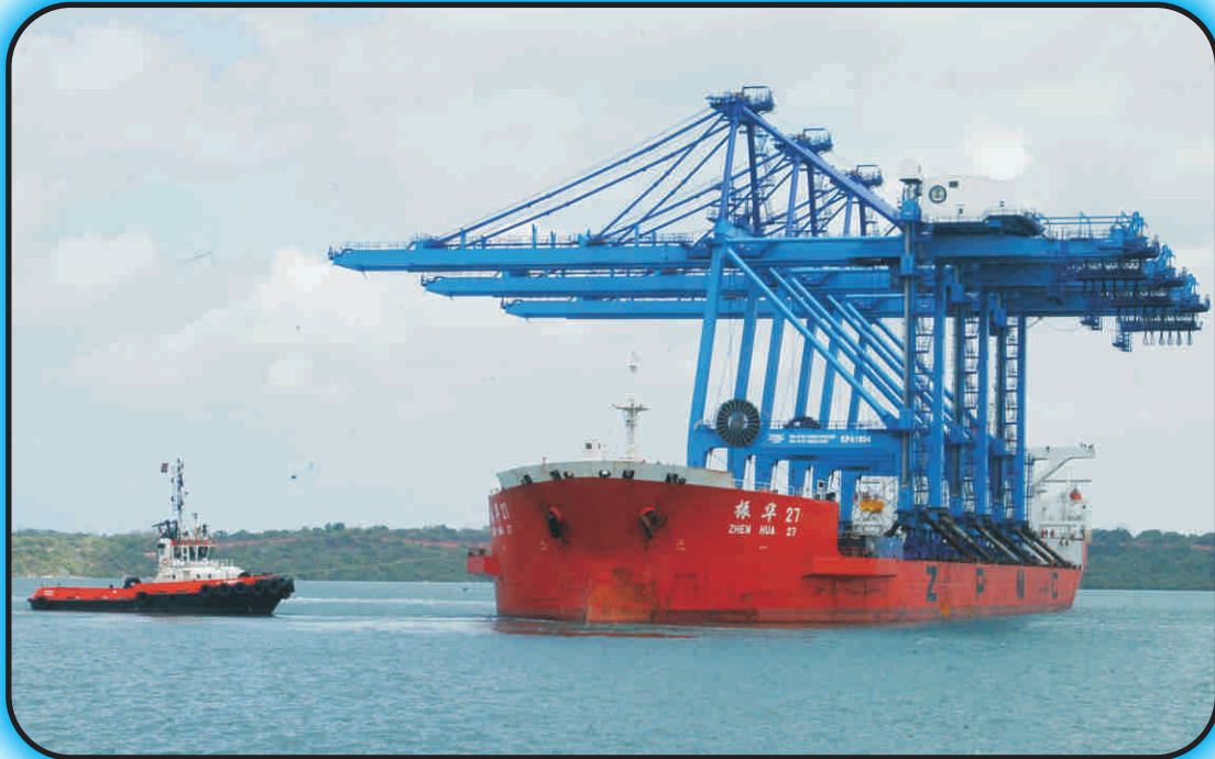
Arrival of STS cranes