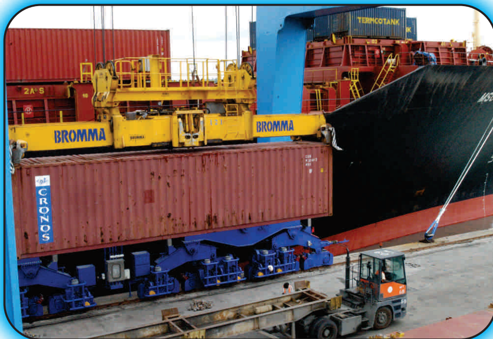
Stevedoring Containerised Cargo