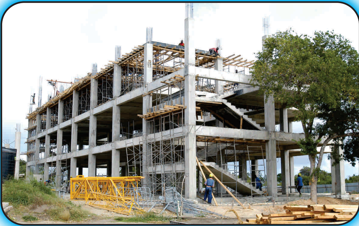
Development of Lamu port Dec 2012