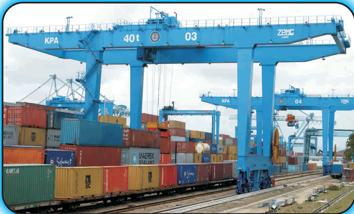
Rail mounted gantries at the terminal